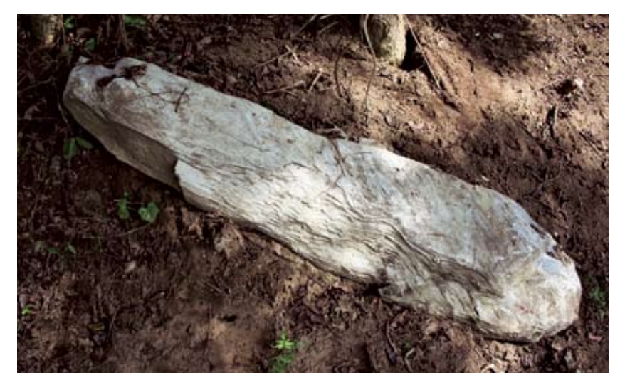
Figure 6. Limestone sema located at MS1.

Figure 5. Three types of inhumations discovered at MS1. Clockwise from bottom left: (1) "bag" burial, (2) extended burial, (3) flex burial.