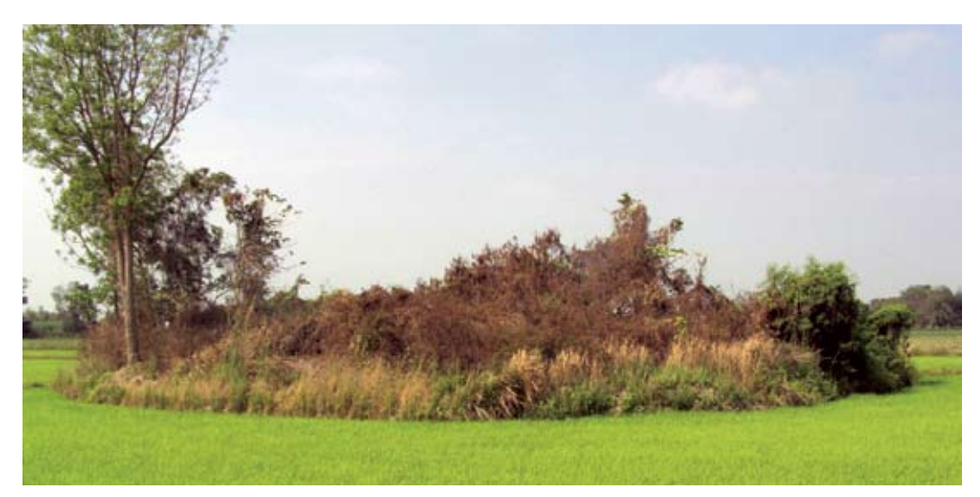
Figure 2. View of Chedi No. 5 in 2010.