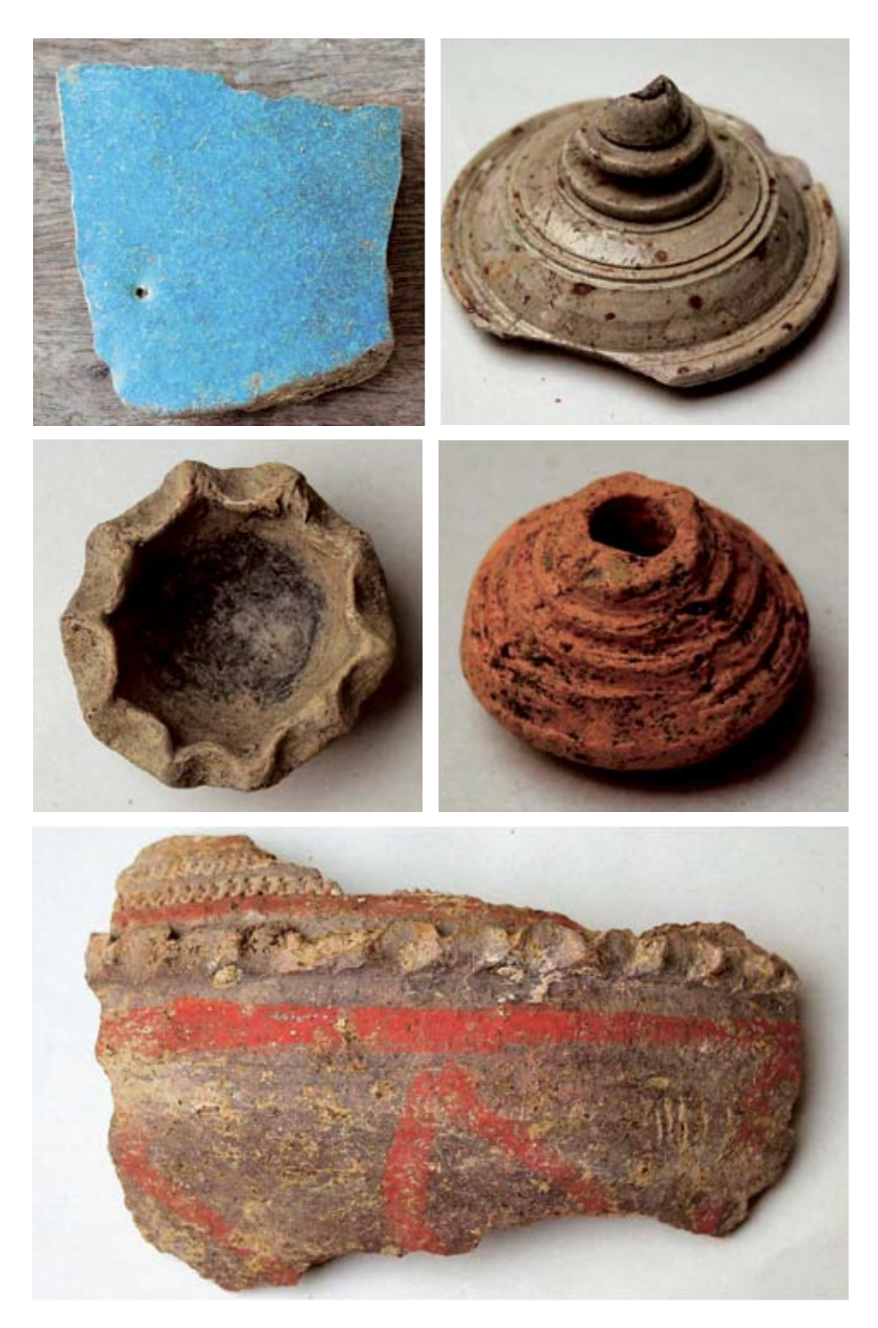
Figure 3. Archaeological objects discovered during the course of excavation in 2009. Clockwise from the bottom: (1) Dvāravatī earthenware pottery, (2) Dvāravatī terracotta oil lamp, (3) Persian ware, (4) green-glazed Angkor-period stoneware, (5) Dvāravatī spindle whorl.