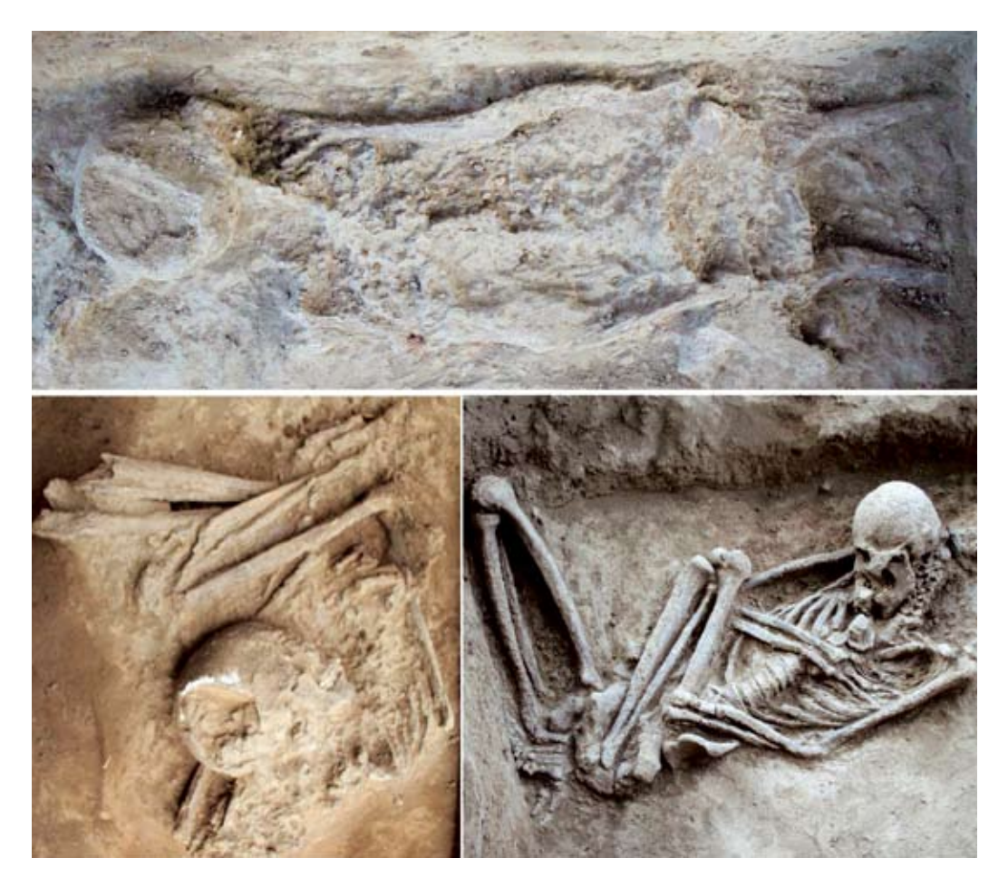
Figure 5. Three types of inhumations discovered at MS1. Clockwise from bottom left: (1) "bag" burial, (2) extended burial, (3) flex burial. Authors' photographs.