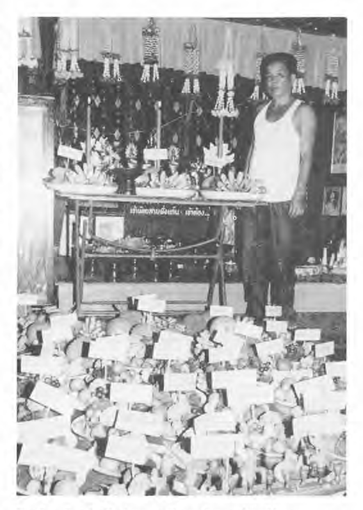
Fig. 3. Food offerings to thewadaa and to khruu .

Thus, the social-moral hierarchy involved actually places the mediums on the bottom rung, paying respect to the superior possessing spirits (thewadaa), as well as when defrocked/depossessed, to monks [Figure 3]. Above the mediums in the middle rung, both the thewadaa and the monks pay homage directly to the khruu or preceptor spirits. This