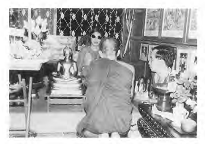
Fig. 1. Theravada Buddhist monk kneeling before a female spirit medium: Chiang Mai, July 1978.

present a paradigm for the ethnography of syncretism in religion in Thailand.