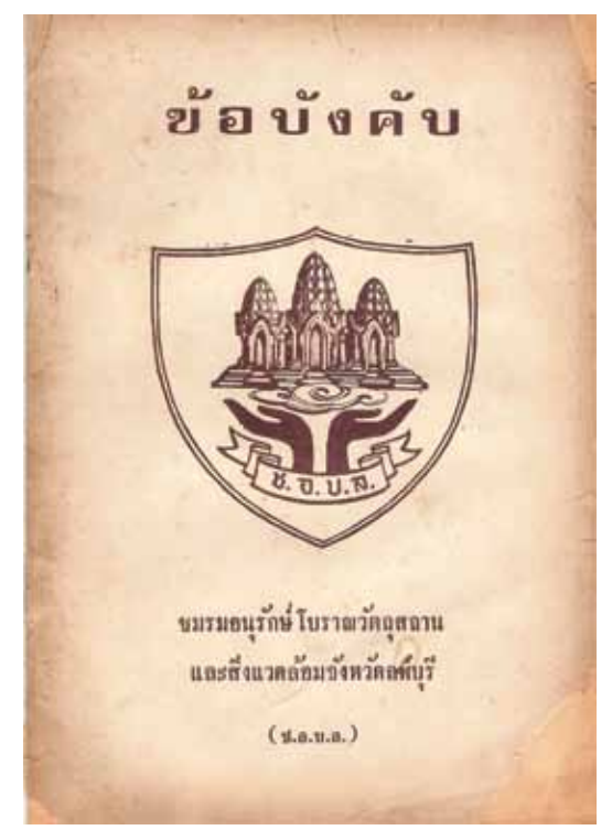
Figure 1. Charter of the Club for Conservation of the Antiquities, Ancient Monuments and Environment of Lopburi Province, 1974

To ensure that the Club's activities had some continuity, it drew up a charter (Figure 1) which defined the objectives of the Club and established an executive