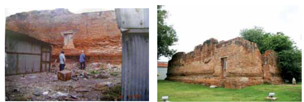
Figure 8. Wat Pun in the heart of Lopburi city before and after a clean-up by the local conservation club

Figure 7. The Lopburi Club succeeded in preventing quarrying at Samor Khon Mountain