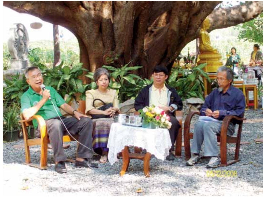
Figure 4. Members of the Lopburi Conservation Club talking at Erawan Mountain

As usual, a company applying for such a concession has to provide an environmental impact assessment for the government to scrutinize and evaluate. And as usual, of course, the research team, no matter whether it was commissioned from a university or private consultancy company, produced a report supporting the company's project and aiding government approval. For example, it reasoned that once the limestone had all been blasted away, trees could be replanted in the whole area. And once the cement factory had been built, a green zone could be designated