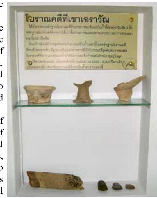
sites, proved that the area was an Figure 5. Prehistoric artifacts found at Erawan M important archaeological source.

The Lopburi regional office of the Fine Arts Department, Ministry of Culture made a survey of archaeological sites on the mountain. The findings, which included pottery sherds dating to the late prehistoric era, and indications that the caves had been used as burial sites, proved that the area was an