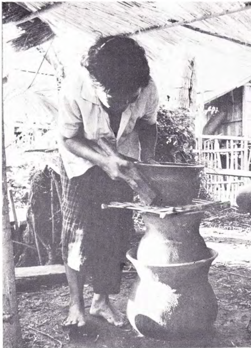
Figure 4b. Expanding the shoulder with paddle and anvil