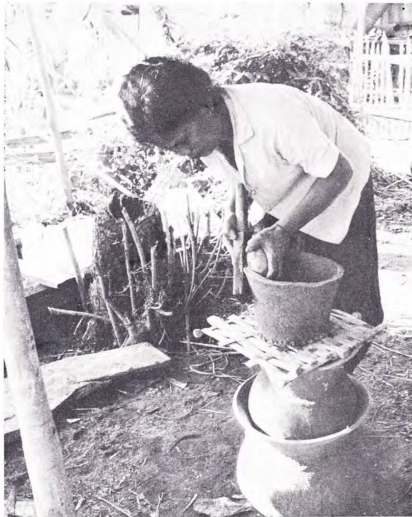
Figure 3b. Shaping the rim with paddle and anvil