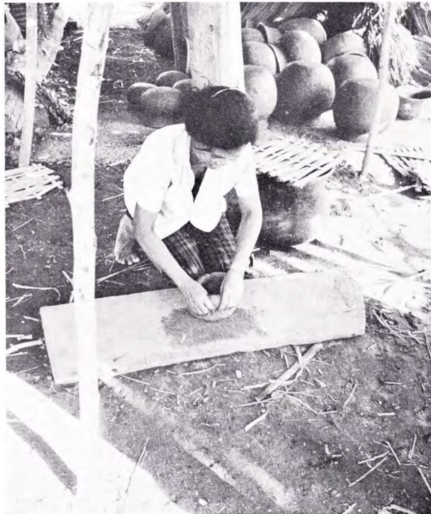
Figure 2b. Formation of the hollow cylinder: first step