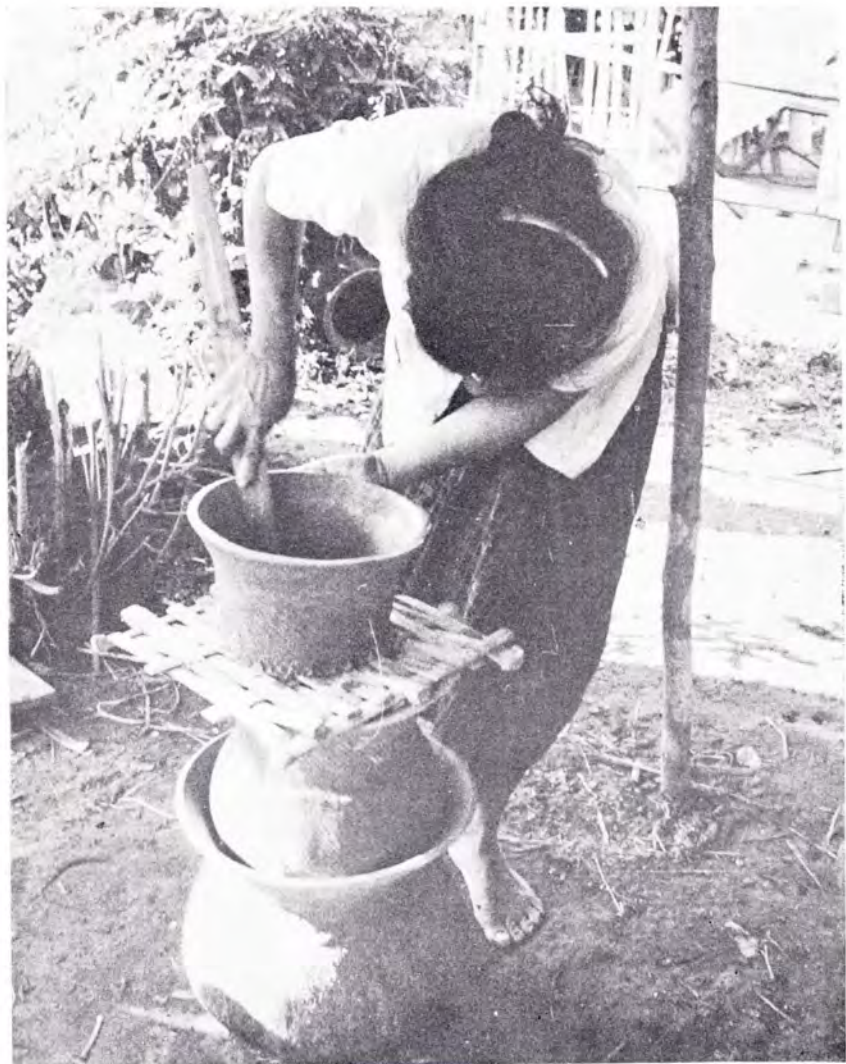
Figure 4a. Smoothing the rim with a bamboo stick