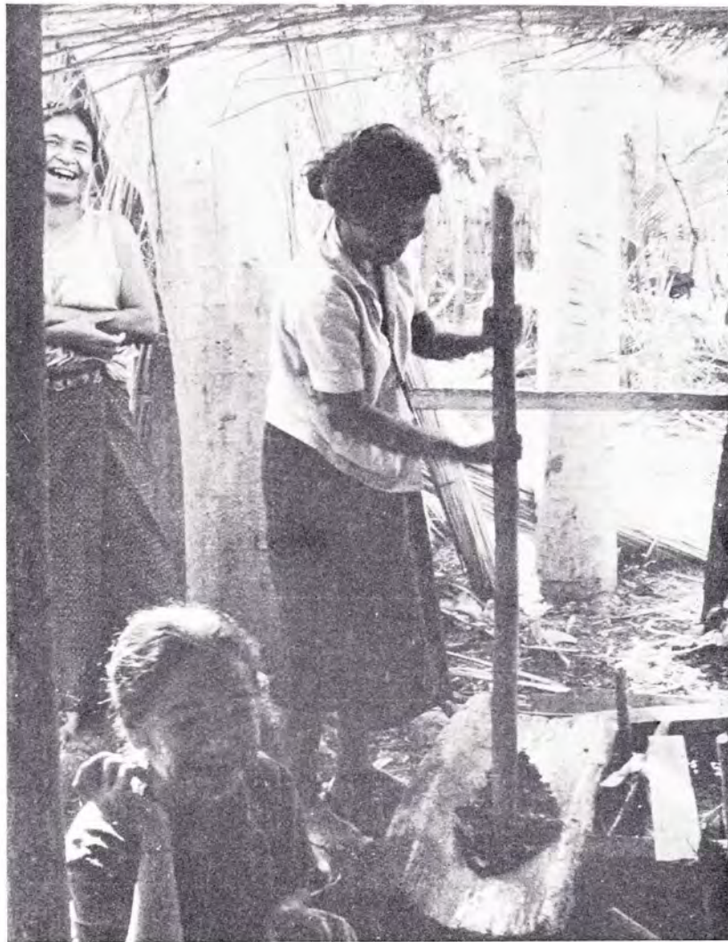
Figure 1b. Preparation of the clay