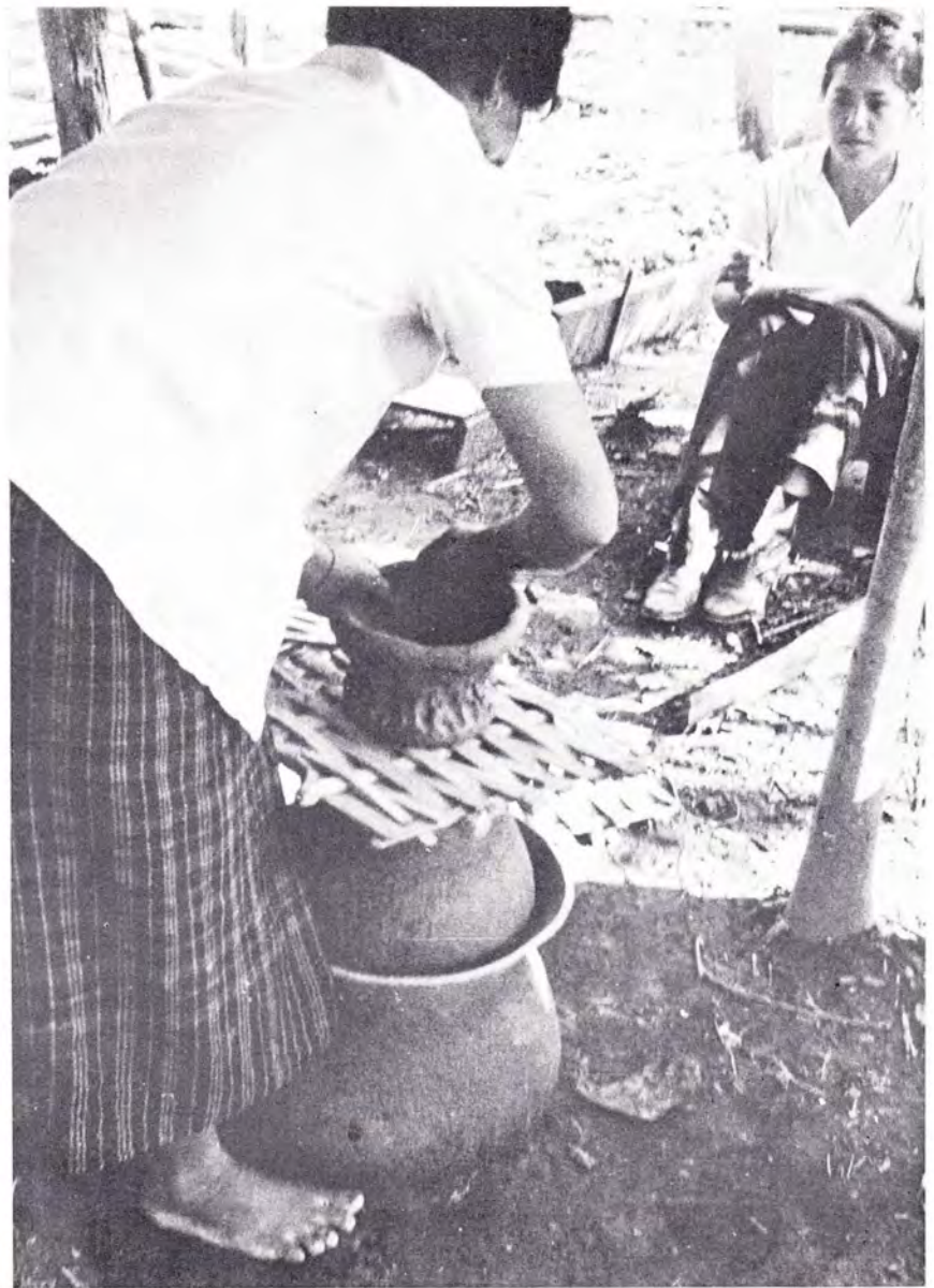
Figure 3a. Formation of the hollow cylinder:second step