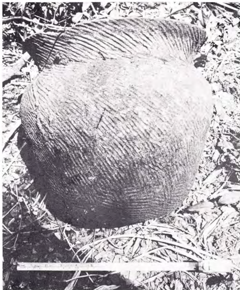
Figure 1a. Large fragment of Na Kraseng water jar