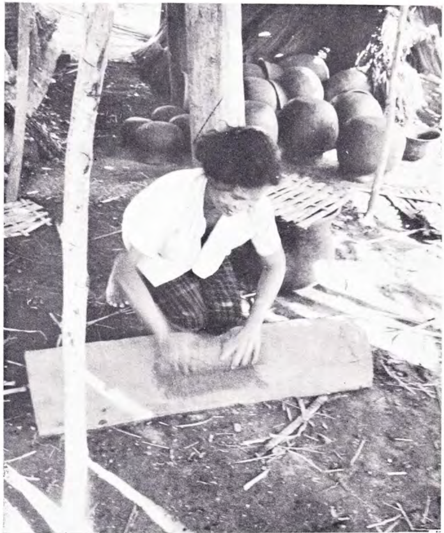
Figure 2a. Rolling the clay cylinder