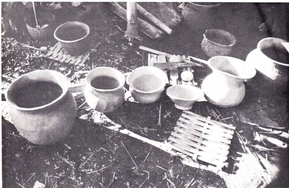
Figure 5b. Vessel types: large water jar, two cooking pots, cup, steamer, and a second water jar