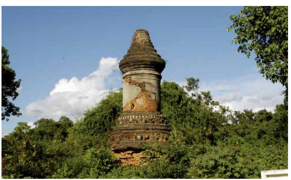
Figure 6. The monument in Lin Zin Gon cemetery before the site was cleared (photo: Woraphat Arthayukti, July 2007)

The Burmese king in the first line is Hsinbyushin (r. 1763–76). His brother, known as Badon or Bodawpaya, became king in 1782 and moved the capital from Ava to Amarapura in 1783.