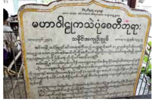
Figure 3. Plaque at Monte Zu sand pagoda in Mandalay