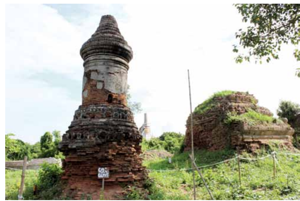
Figure 7. Lin Zin Gon after clearing (photo: Woraphat Arthayukti, 25 September 2012)

This old document, stating that the funerary rites for the former king were held at Lin Zin Gon, would seem to offer a degree of proof that the monument at Lin Zin Gon today is his tomb. But the document is problematic in several ways. First, the image shows a man in royal attire, yet the text states clearly that the former king was in the monkhood while in Burma. Second, the last line muddles the names of the two last kings, calling Uthumphon by the name of his brother Ekathat who died in the fall of the city. These errors and inconsistencies bring the credibility of the document into question.