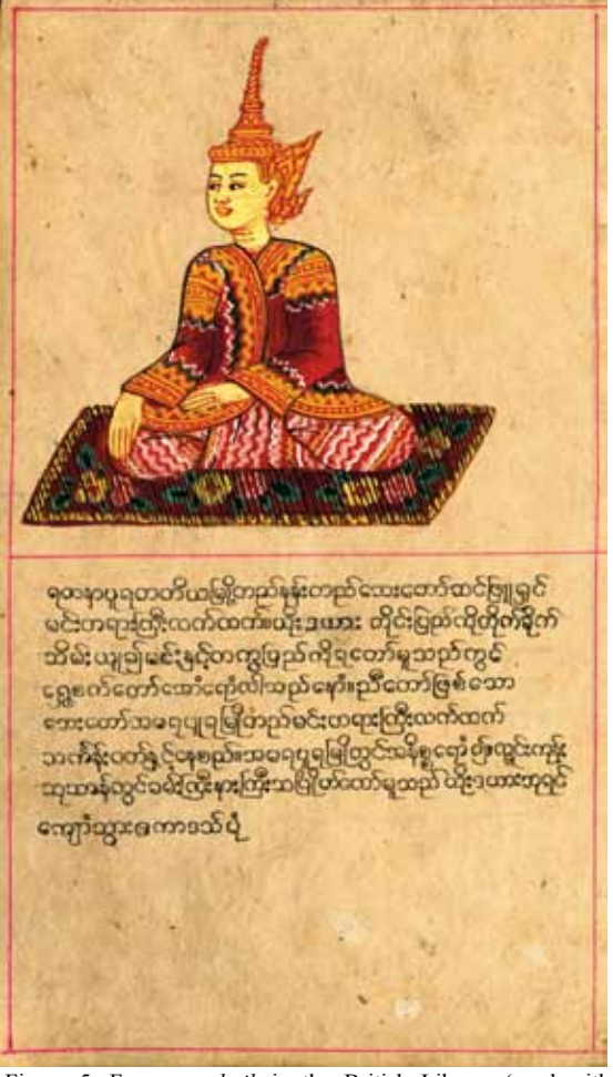
Figure 5. From parabaik in the British Library

now stored in the British Library, is a parabaik , or accordion book, which states on folio 288, here translated line by line by Dr. Tin Maung Kyi (see Figure 5):