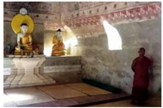
Figure 2. Yodaya Ordination Hall in Maha Teindol Temple, Sagaing

Some were settled across the Irrawaddy River in Sagaing. To this day, the area is famous for silver and bronzeware skills believed to have passed down from craftsmen among the prisoners. There are temples built in the Thai style with internal walls painted in the distinctive style of Thai murals (see Figure 2). Nearby Amarapura is famed for silk, also linked to the Thai prisoners.