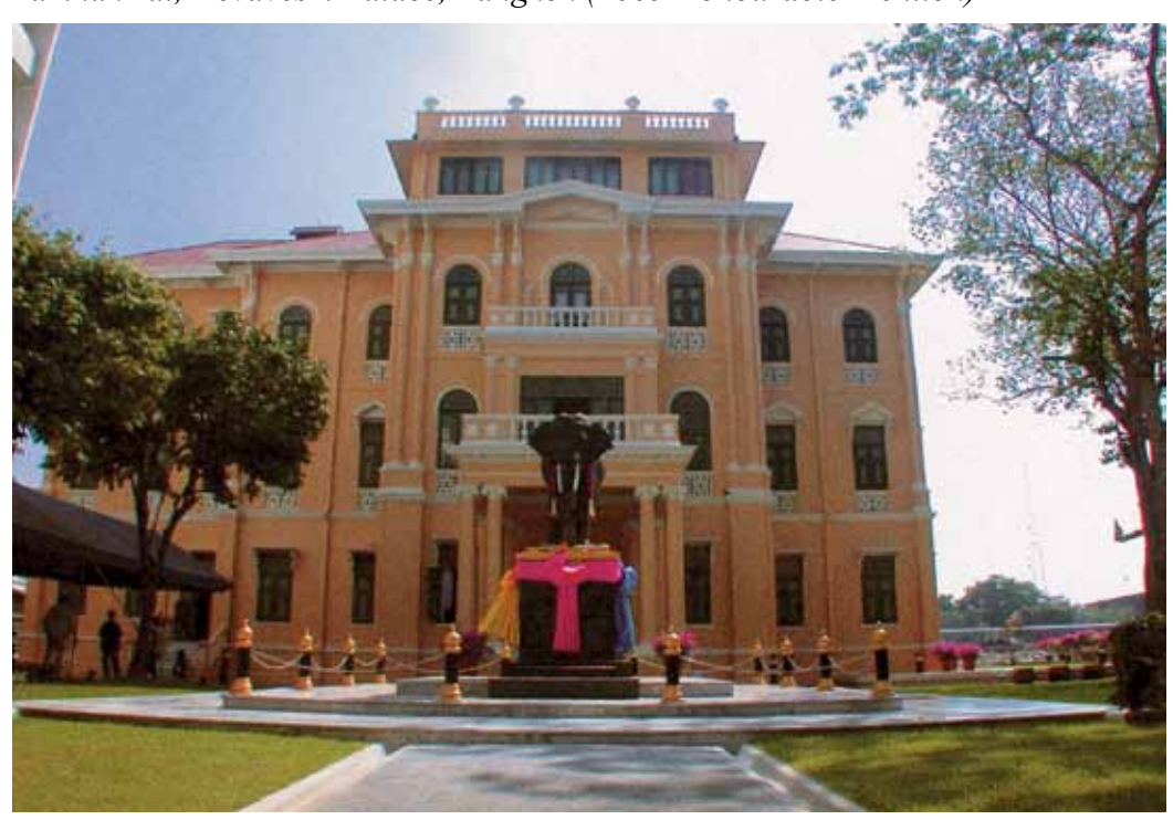
Tamnak Yai, Devavesm Palace, Bangkok (2005 Honourable Mention)

The Nara Document does not provide a license for cultural relativity, but rather, reaffirms the validity of a rational system for evaluating and consequently safeguarding various heritage values, one that is consistent within its own sociocultural system. In so doing, social, cultural and spiritual values may gain a foothold alongside artistic and historic values in the conservation process.