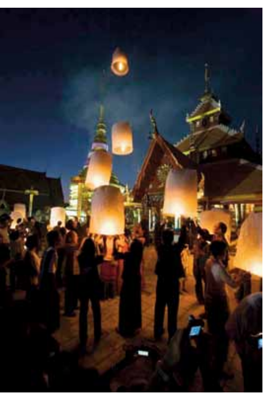
Kom loi at Wat Pongsanuk to celebrate receiving the UNESCO Award

The restoration of Wat Pongsanuk in Lampang provides a case in point. The temple's deputy abbot, community leaders and senior craftsmen worked alongside academics from Chiang Mai University, contributing local knowhow and institutional memories about caretaking of the temple's collection of Buddhist artefacts and buildings. While certain knowledge had been lost - such as the production of ancient glass mosaics other neglected skills such as traditional lime slaking and paper cutting for ritual objects was revived within the context of restoring the temple. The renewed interest in all things Lanna catalyzed by activities at the temple has turned Wat Pongsanuk into a learning hub for Lampang and nearby provinces. The documentation of such revived knowledge and its dissemination through networks of like-minded local communities and monks has led to a renaissance of northern Thai building arts.