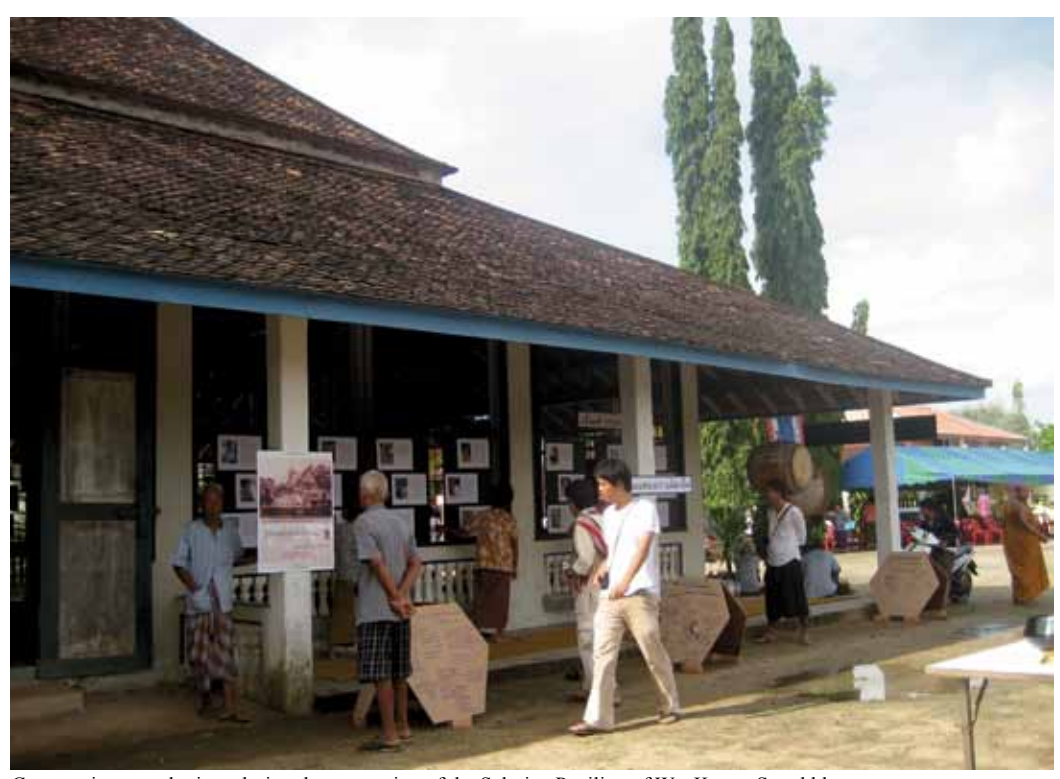
Community consultations during the renovation of the Salarian Pavilion of Wat Kutao, Songkhla

Conservation can also serve as a mechanism for community revival using cultural resources as the driver for social and economic growth. The case study of Samchuk Community and Old Market District in Suphanburi showcases the potential of historic buildings and traditions as a basis for reversing the declining fortunes of old neighborhoods. Through the determination of local businessmen and civic leaders, Samchuk was transformed from an almost abandoned town on the verge of partial demolition. The town's strategy for revival was predicated upon