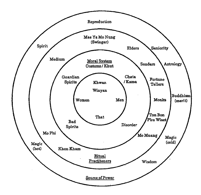
Diagram 2: The structure of northern Thai moral system

used to check morality which is felt through violation of external forces found on the second circle from the inside. These external forces which include khut (calamity), chata (fate), kamma (destiny), phi (spirit) and hit (precepts) can reinforce morality in a sense that they can affect the individuals' internal equilibrium and his or her social relationships. They can cause a person illness as a punishment for failing to observe certain rules continues and rituals which can result in misfortune or an attack by spirits. Observing them, however; can improve one's destiny (Anan and Shalardchai 1990).