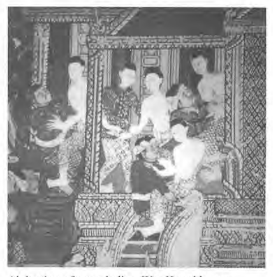
Abduction of court ladies. Wat Kongkharam

Four soldiers are forcibly carrying off ladies from the palace. The ladies are unwilling.