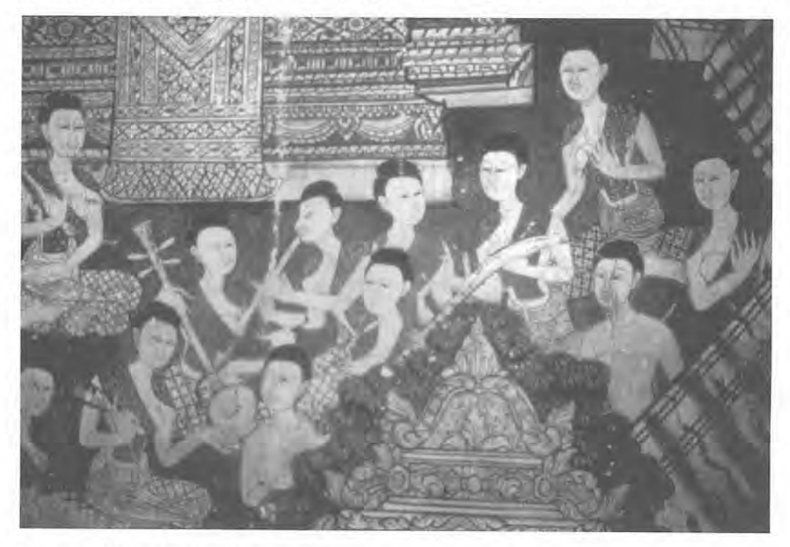
Female musicians, Wat Khongkharam. 1780

Women figure prominently as court musicians in some of the most beautiful pictures of all. The presence of all-female orchestras is well known. Men are shown playing the same instruments in some cases. A women's group and a men's are artistically paired on opposite sides of a monarch in one painting in Buddhaisawan throne room. They are supposed to be angels or minor deities but are clearly representations of actual people. There seems to be a tendency for men to play percussion instruments. Dancing for religious or for entertainment purposes has been associated with women the world over. There is a beautiful and