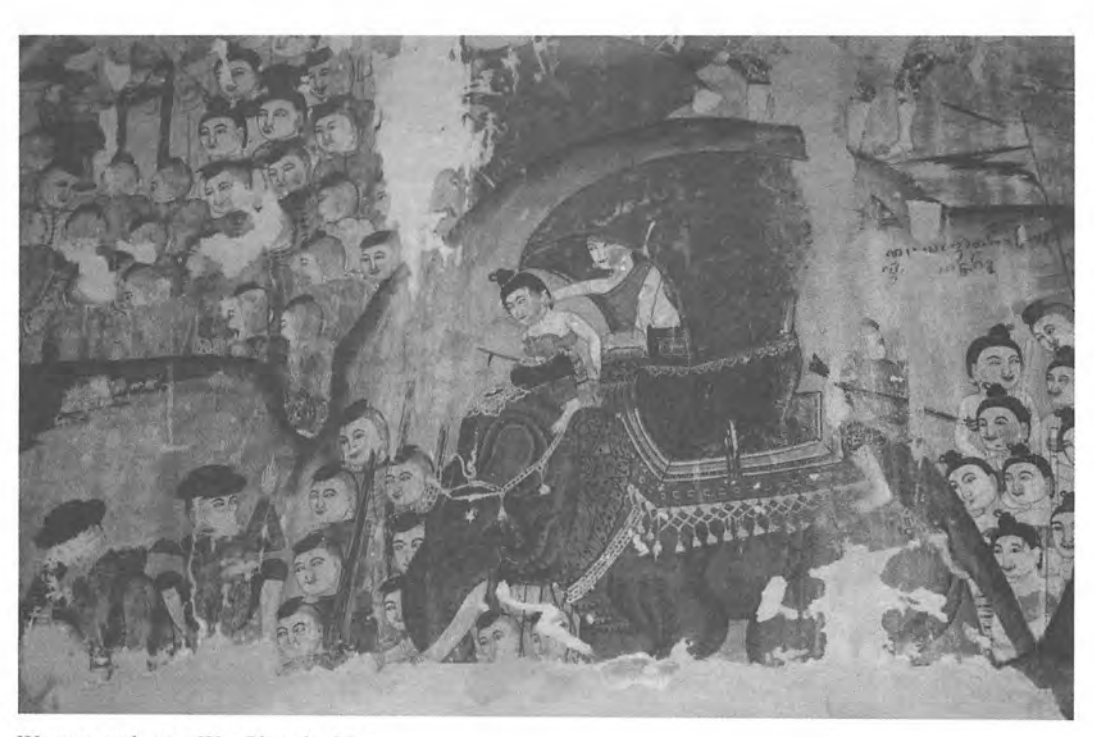
Woman mahouts, Wat Phumin, Nan