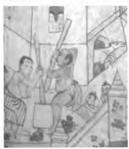
Rice pounding, a scene from Vidhura Pandita Jataka, Wat Chong Nonsi, 1670

An intriguing mystery in a complex painting is the picture of a man pounding rice with a woman c1670. Whilst this is normally regarded as a female task, (as shown in the Wat Chong Nonsi sequence), similar pictures of joint labour in