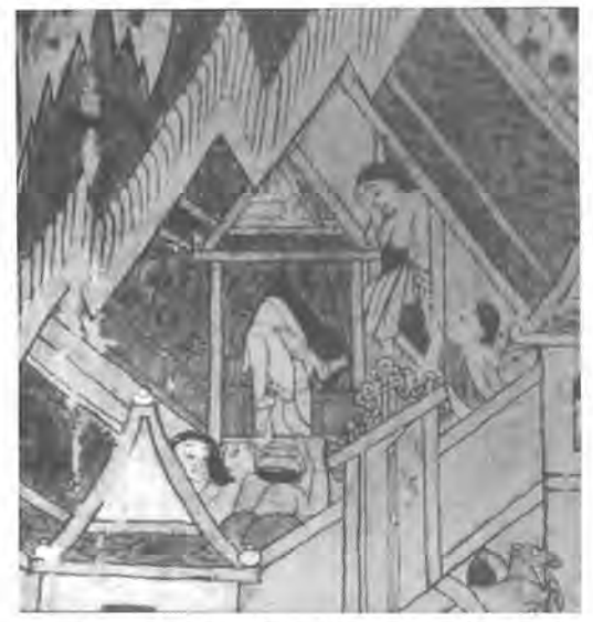
Sexual activity, also from Vidhura Pandita Jataka. Wat Chong Nonsi. 1670

theme is of Vidurapandita being taken away by the ogre Punnaka, at least equal prominence is given to two sexual scenes. The lower part of the scene, where the rice pounding by man and woman together is a courting preliminary and is a very funny portrayal. The fun is earthy but it shows the budding sexual relationship as joyful and affectionate even though outside forces are about to disrupt it in humorous fashion. The scene above is different in tone. Sex there has no joy. It may be showing the end of a small sex orgy. Assorted couples appear to be still at it, resting or looking on whilst one women, exhausted and downcast, staggers partly clad and dishevelled from another room. Two neatly dressed women are pointing at her in disapproval. There is no sign of her male bedfellow(s).