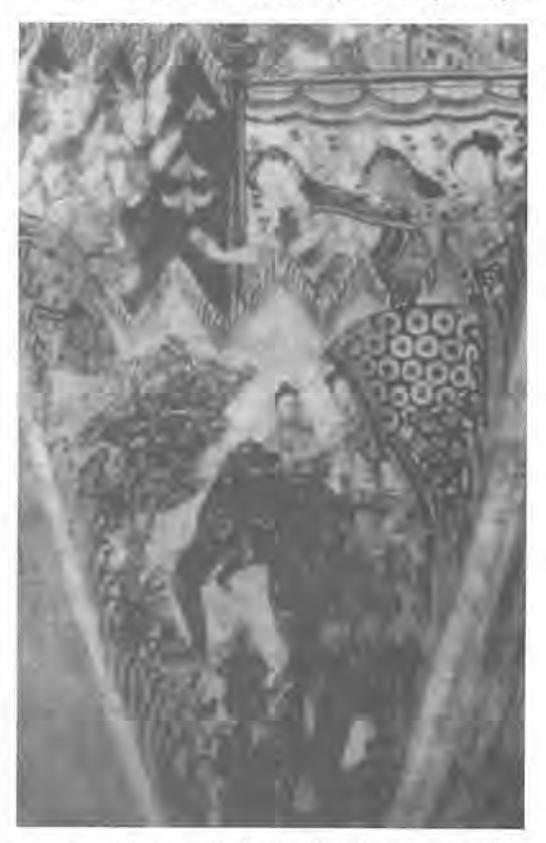
Female mahout, at bottom, Wat Ko Kaeo, 1670/ 1730

Amongst initial surprises perhaps, are the women shown as mahouts, elephant drivers, a task that is generally regarded as an exclusive male task and nowadays is such. The close retinue of queens or princesses at times had to be composed of females and consequently female mahouts here should not be entirely unexpected. However, in other pictures men are also shown as mahouts to princesses. While murals such as a panel in Wat Ko Kaeo (Phetchaburi) has woman driver, the most clearly visible evidence of women mahout is to be found in the khoi manuscript paintings. One volume has no fewer than six paintings with female mahouts including one dated to the reign of King Prasat Thong (1629-1656 AD). (Somphop, 1977) Other samut khoi examples of Ayutthaya