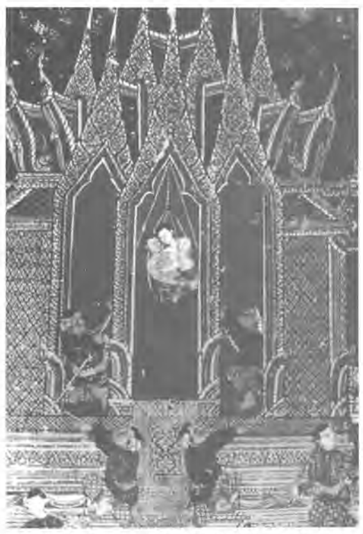
Chak Sarak, a punishment for woman's sexual transgression. Wat Khongkharam

The above would seem to be an example of chak sarak. an old punishment for disgraced women found to be offending against sexual mores. It applies to women but not to their male partners in sexual "crime". The phrase, chak sarak forms part of an old saying that lingered until recently in the vocabulary of abuse of some court ladies. Its latter day connotation is a refined insult to a lazy woman who acts (or