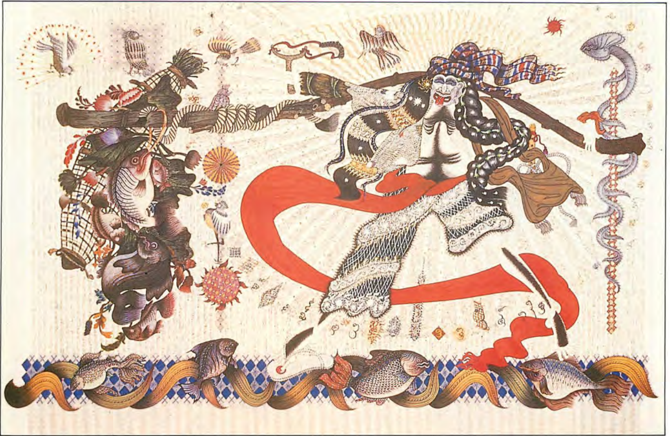
"Heaven's Decree," by Prasong Luemuang. The theme is fertility, symbolized by the fish. A corpse-like figure, gushing blood, dances like Shiva with an Axis Mundi to left and right (p. 50).