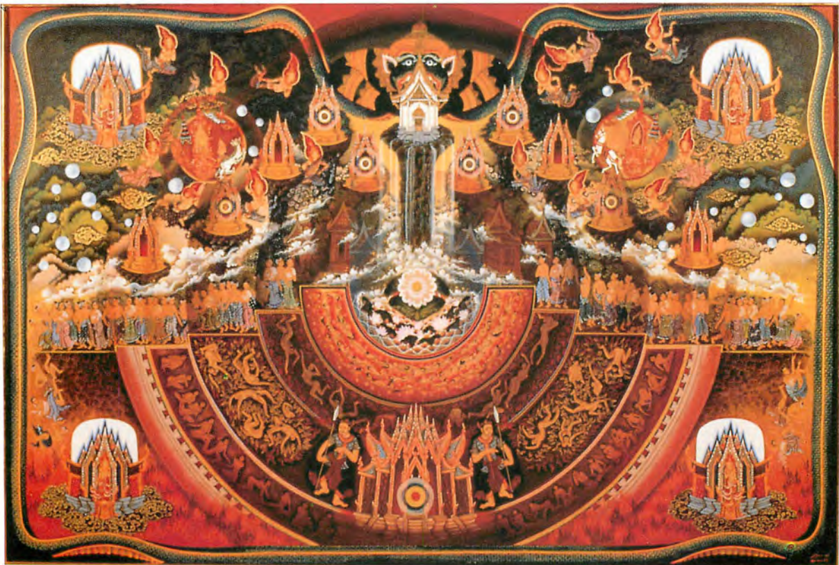
"Lotus at the Centre of the Universe," by Prasat Seri. Heaven, Earth and the Underworld (p. 50).