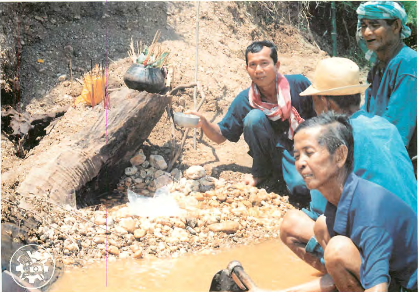
Villagers identify a Door to the Underworld, source of health and plenty. Thai Rath Newspaper , 14 September 1989.

A Westerner might at first dismiss this behaviour as a manifestation of ignorance, superstition and a degradation of Buddhist rationalism.