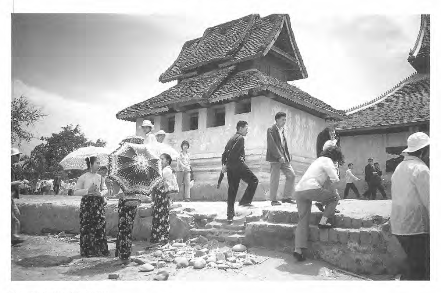
Tai architecture in Xishuangbanna.

as its center. According to historical records, this regime "regarded the Emperor of the Chinese heavenly dynasty as their common lord," <sup>25</sup> and had some subordinate relationships with the Chinese interior. This indicates that the history of the Tai people has developed in keeping with the inevitable laws of social development.