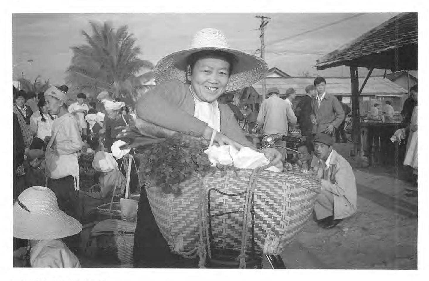
A Tai vegetable vendor with typical baskets in Xishuangbanna.

tions. This shows that the entrenched domination of the House of Duan in Dali ended indeed in "migration" — not in migration to the south, but in migration to the north.