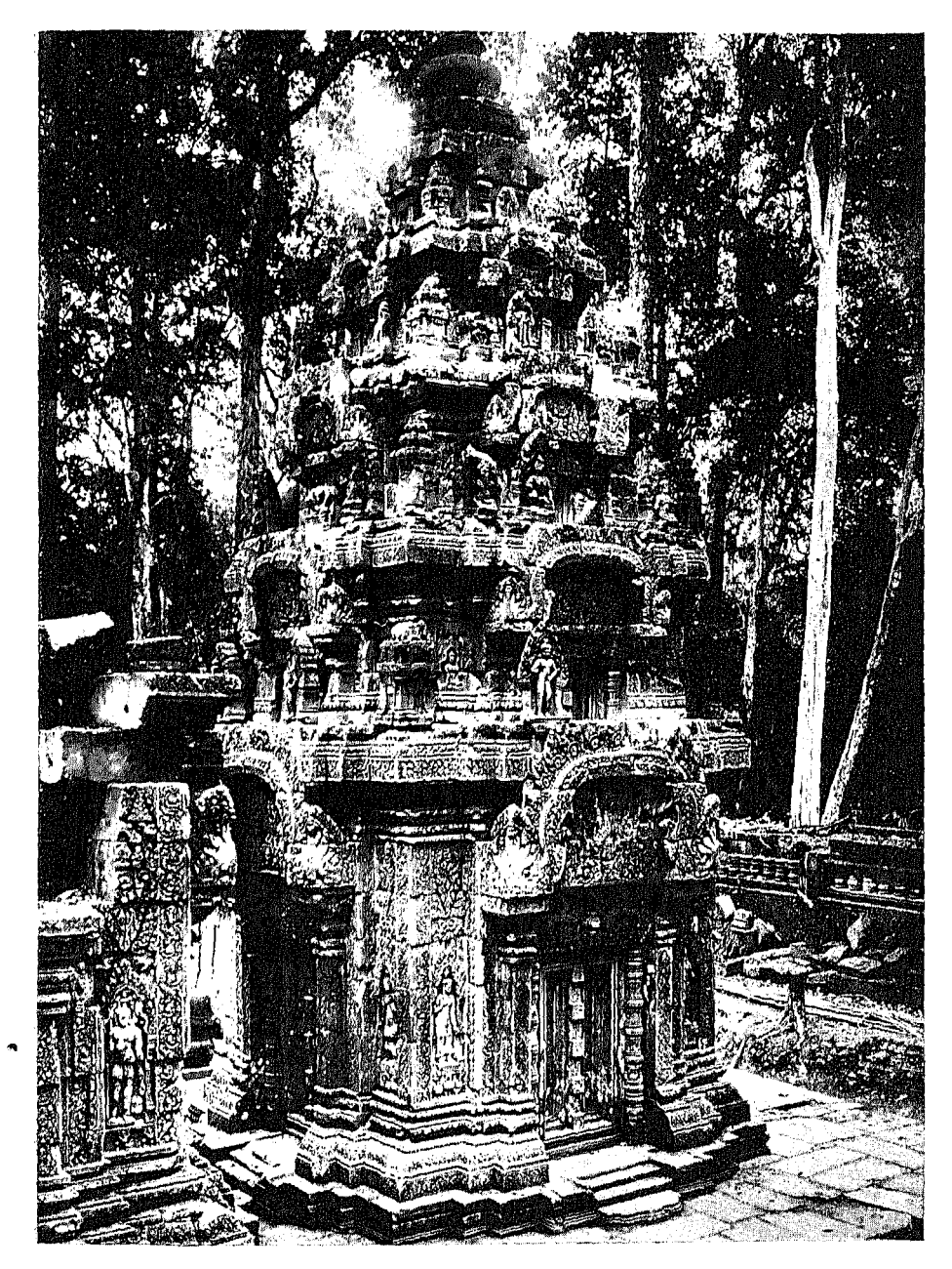
Banteai Srei,-South Sanctuary, seen from N. W.