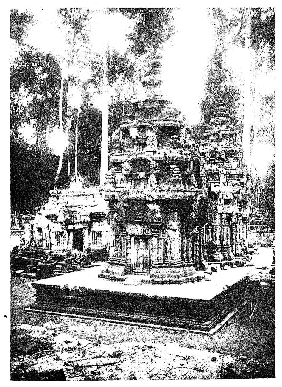
Banteai Srei,--North Sanctuary, seen from N. W.