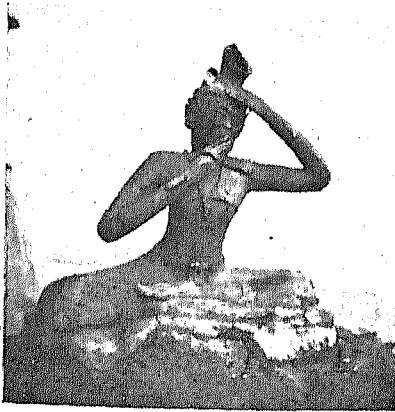
3. The patient has a head-ache, is feeling unwell and, on account of startling vomiting, he is bowing forward slightly. His eyes are closed because he is feeling tired and ill.

The slabs indicate the name of the devil below the slab. Some of these coloured pictures have disappeared due to weather influences.