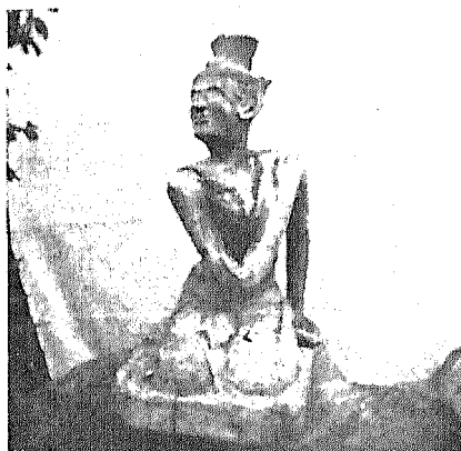
6. This statuary shows pains in the left shoulder and in the corresponding muscles and nerves. The face is expressing the patient's anger about these pains, which might detain him from work.