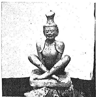
7. This statuary shows pains in the lower part of the neck; also expressions in the face showing pain and anger;