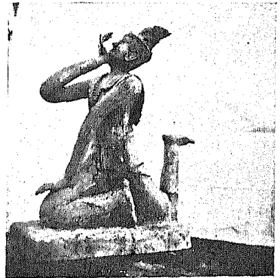
4. This statuary shows pains in the neck (stiffneck). With his left hand the patient presses the right leg and the left fore-leg is bent upward. With his right hand the patient presses his head backward. The angles of the mouth are drawn down as a sign of heavy pains. The face shows not only the pains, but also the wish to overcome them quickly.