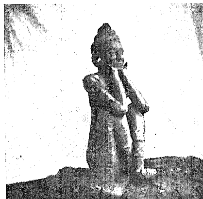
8. This patient shows that he has a tooth-ache, the upper parts of his hands are pressed on the lower jaw-bone and at the same time he is massaging his mandibular-nerve from both sides; this nerve is innervating the lower jaw-bone.

For further medical pictures of Wat Pho (Wat Phra Jetubon) please refer to JSS , Vol. XXVI Pt. 2. The Inscriptions of Wat Phra Jetubon by H. H. Prince Dhani Nivat.