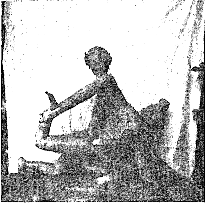
1. Ancient Thai Massage as practised by the Mo'-nat .

In this picture the masseur is putting his right foot on the patient's left hip, and while doing so, he pulls the patient's right leg.