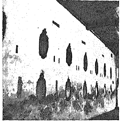
2. Inscriptions on the wall of the first of the two pavilions dedicated to medical science in Wat Pho (Wat Phra Jetubon).

In this picture the masseur is putting his right foot on the patient's left hip, and while doing so, he pulls the patient's right leg.