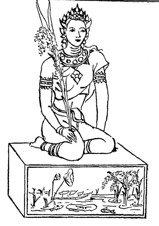
Me Posop (front view)