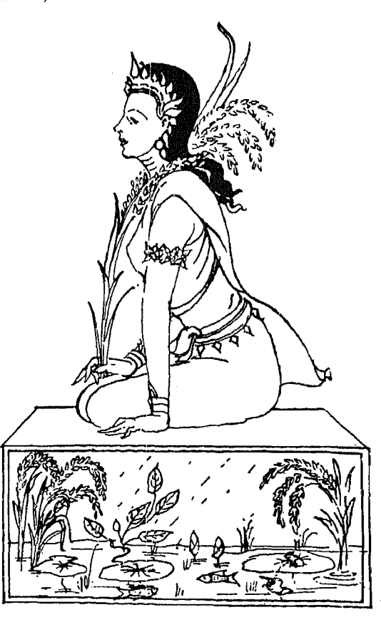
Me Posop (side view)