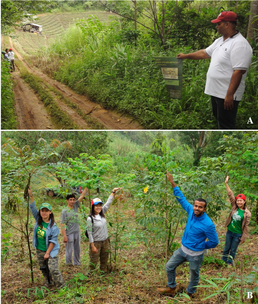
Figure 5. A, At BMSM, a student holds the remains of the 2009 plot sign. Immediately behind him, a few of the planted trees survived, but most of the plot in the background was converted into a cabbage field by 2016, perhaps reflecting waning commitment of villagers (“project fatigue”), as the project enters its 21 st year. B, In contrast, the BPK villagers maintained trees, planted in 2015, well. After 15 months, most of the trees had grown taller than 2 m, reflecting enthusiasm at the start of a project.