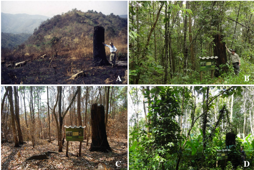
Figure 3. A desolate site in the upper Mae Sa Valley (A) was planted with framework tree species in 2000. Twelve years later (B) a structurally complex forest with high biodiversity was restored. But tree-chopping by villagers opened the canopy, allowing fire to destroy the understorey and kill many of the adult trees in 2016 (C). Two rainy seasons after the fire, dead standing trees dominate the plot and the understorey has been replaced with invasive herbaceous weeds and banana plants (D).

BMSM nursery) reduced the price of saplings by 20% below actual production costs (also contributing to the project “in kind”). This reduced total cash costs to 170,000 THB, freeing up a 30,000 THB underspend. The villagers then opted to invest this in establishing their own tree nursery. Having just learnt about sapling production costs (during the spreadsheet session) and having a potential buyer for 10 years (if Tipco continued with the project), they immediately recognized an opportunity to divert more of the project funding through the village economy in subsequent years. LEAF then offered to hire FORRU-CMU to run a workshop for the villagers in nursery management and tree propagation. Therefore, during the spreadsheet costing process, the villagers effectively agreed to forego payments to individuals (for labor), in favor of investing in a community venture with potential to generate income over many years subsequently, but at some risk (i.e. if TIPCO decided not to continue with the project after the first year).