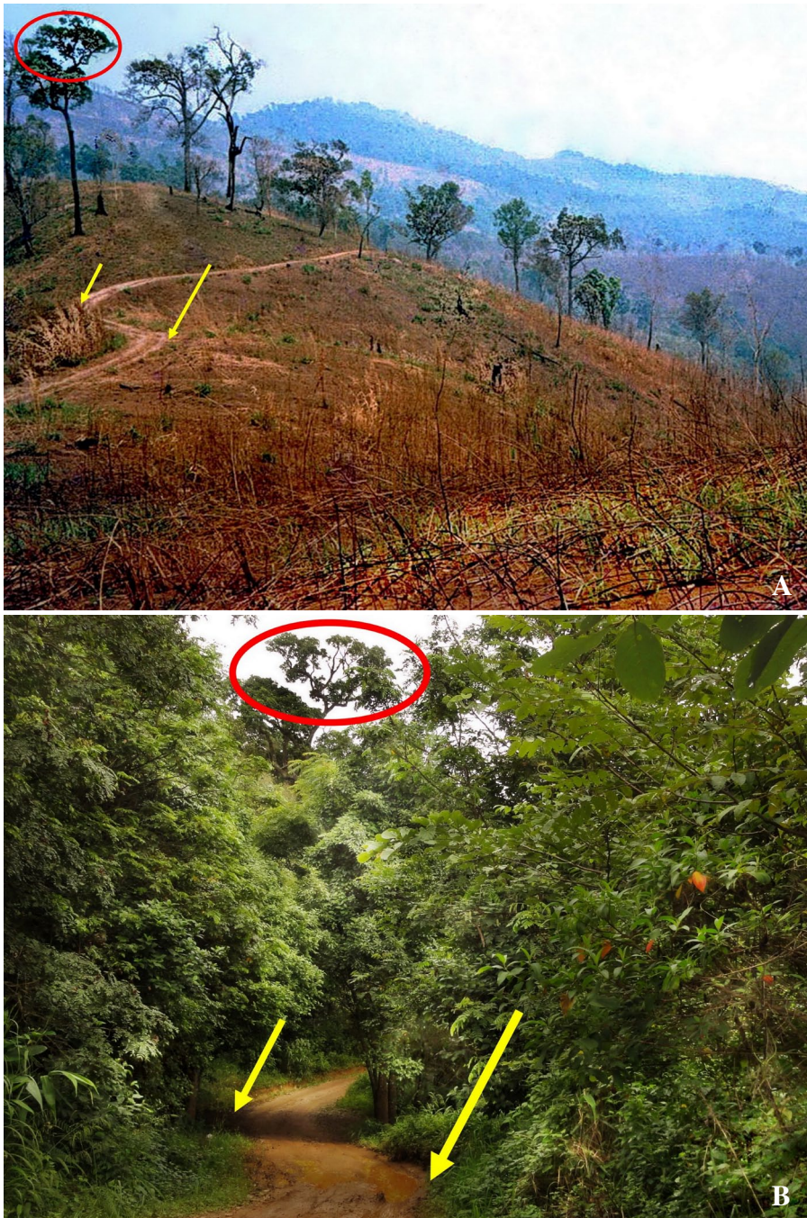
Figure 2. Forest restoration using the framework species method has transformed the landscape of the upper Mae Sa Valley. A, April 1998: fire ravaged the area. B, The bend in the track (yellow arrows) is now over-arched with forest planted in 2001 (left side) and 2007 (right side) (photographed September 2016). The crown of a large tree, which survived the 1998 fires, circled in red serves as a reference point.