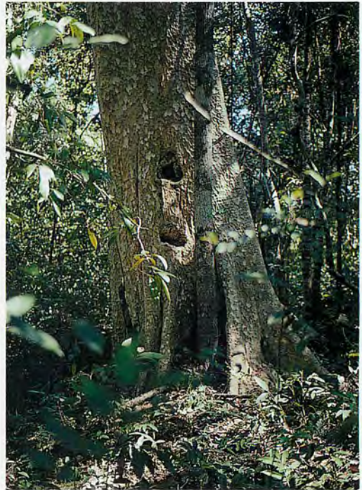
Figure 6. A Lagerstroemia calyculata tree which had a hole cut in the trunk with an axe to allow a monitor lizard to be captured from within. The tree was used as a roost by Rhinolophus acuminatus .