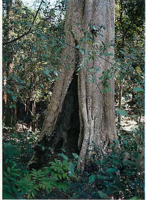
Figure 5. A typical roost site of Megaderma spasma in the tree Lagerstroemia calyculata , a species which often becomes hollow with age.