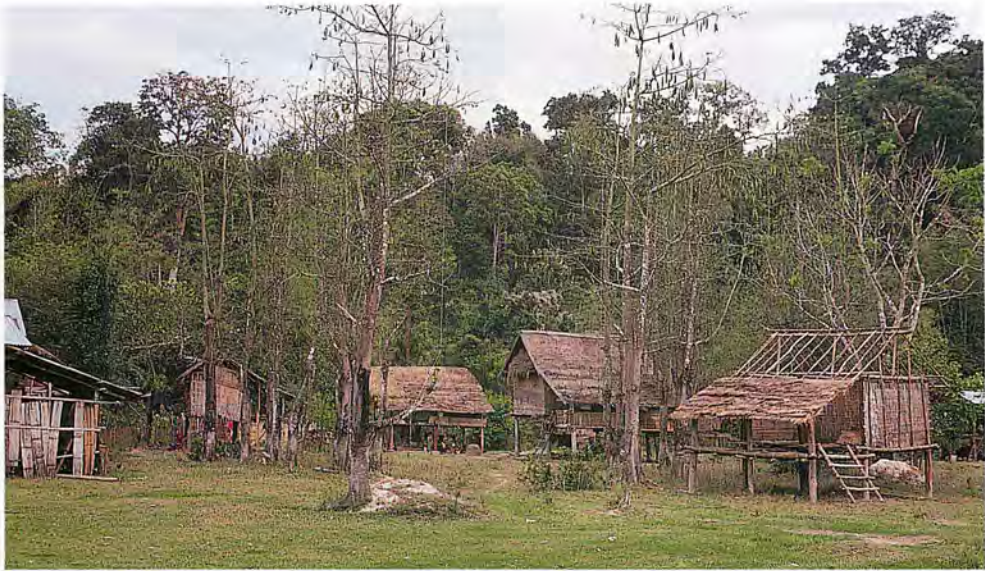
Figure 2. Ban Taong, with kapok Ceiba pentandra , a bat pollinated tree, in the foreground. Two species of fruit bat, Rousettus leschenaulti and R. amplexicaudatus , were caught feeding in these trees.