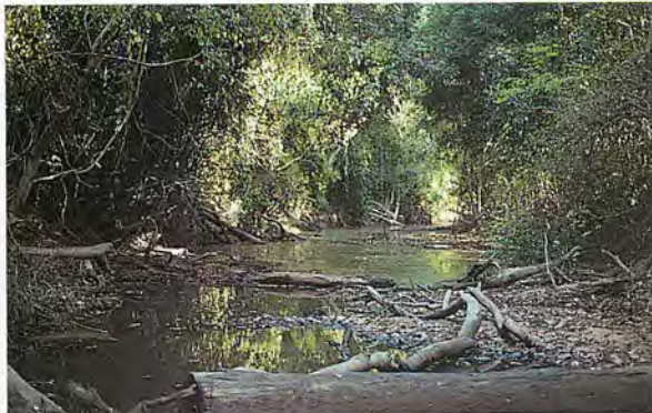
Figure 3. The Houay Kaling, a seasonal stream, with perennial deep water pools. The riparian habitat was semi-evergreen forest with mixed deciduous forest forming a transitional zone between it and the surrounding dry dipterocarp forest.