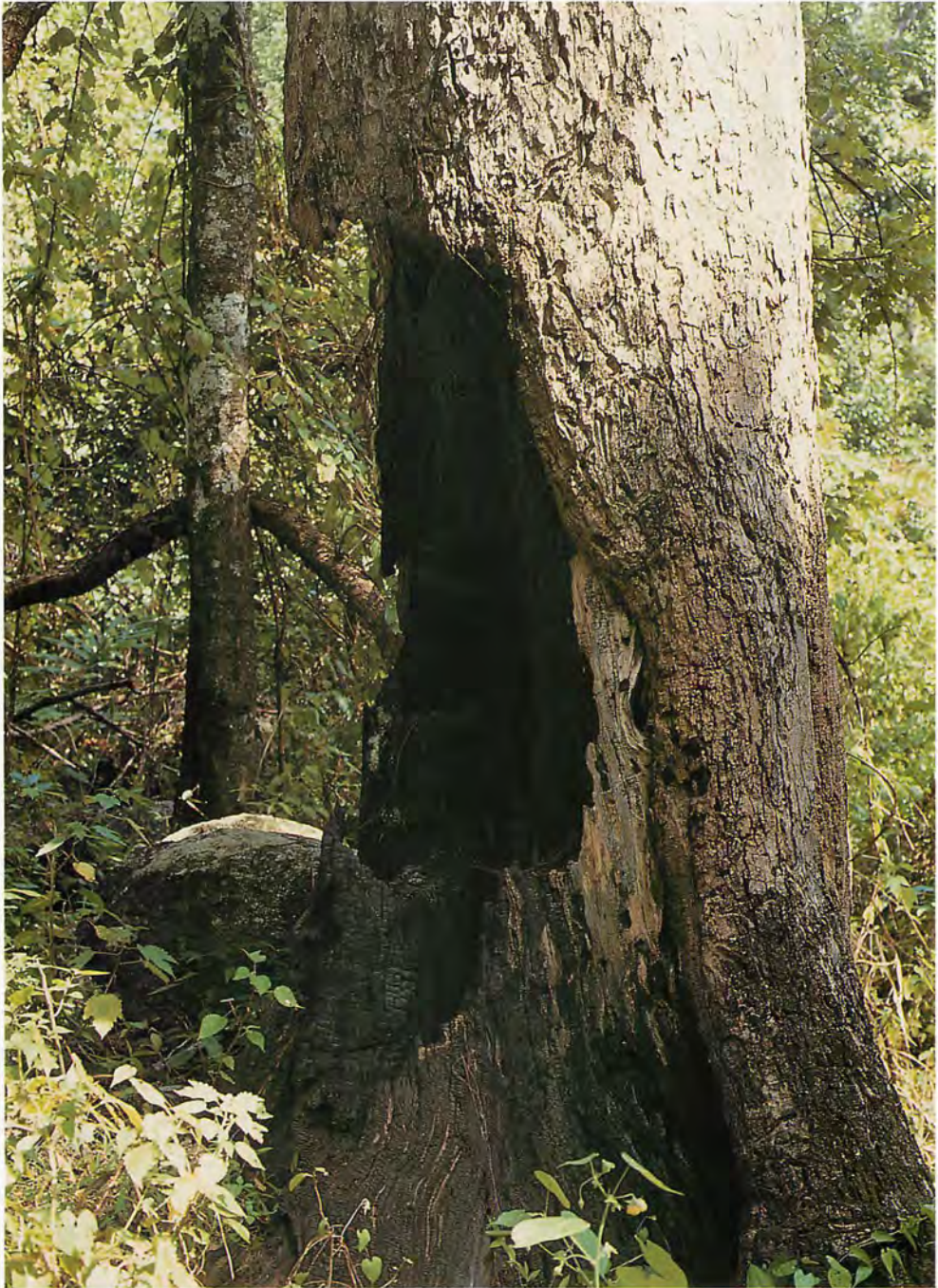
Figure 6. The result of several fire seasons eating away at the "yang oil" holes at the base of a large, healthy dipterocarp.