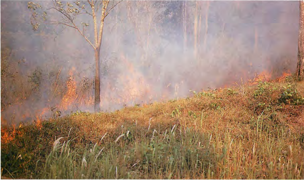
Figure 4. Dry season fires burning dry dipterocarp forest in Huai Kha Khaeng Sanctuary.