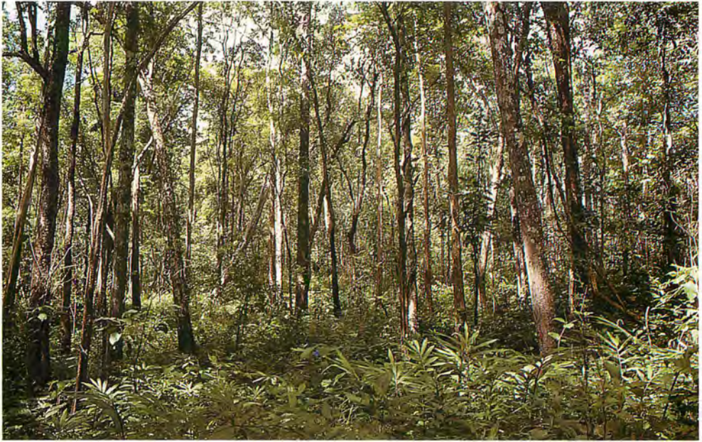
Figure 2. Fire-influenced dry dipterocarp forest in Huai Kha Khaeng Wildlife Sanctuary.