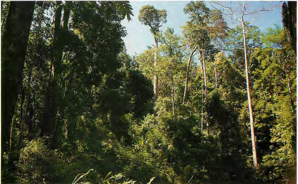
Figure 3. Dry evergreen forest around Khao Nang Rum Research Station in Huai Kha Khaeng Wildlife Sanctuary.