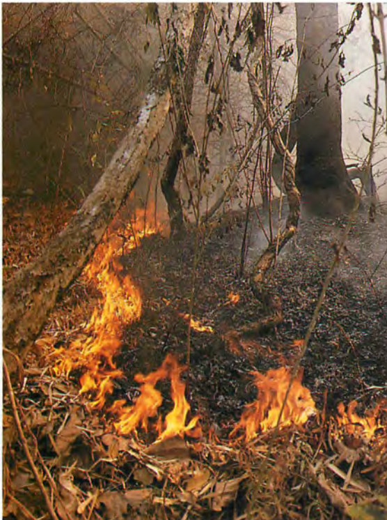
Figure 5. An advancing ground fire in dry dipterocarp forest in Huai Kha Khaeng Sanctuary.