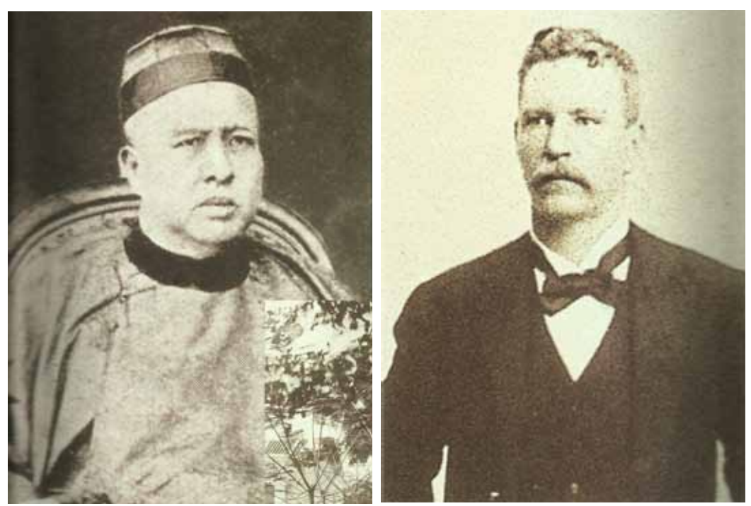
(Arnold Wright & H.A. Cartwright, Twentieth Century Impressions of British Malaya, 1908)