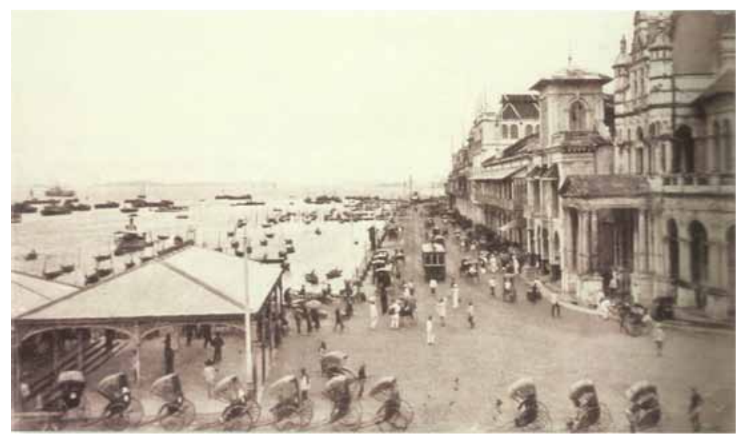
Johnston's Pier where King Chulalongkorn landed in 1896 (Charles J. Kleingrothe, Malay Peninsula, 1907)

inspecting and learning everything on offer in the very tight programme of a "study tour." He visited the post office, the telegraph office, the fire brigade, a hospital, a school, a market, a shipyard and a jail.<sup>49</sup> Many of these examples soon materialized in Bangkok, such as modern buildings and roads. Aside from the "material" aspect, the workings of a modern system of administration in Singapore could not but provide inspiration for the King's future reform of the antiquated governmental system, both on the civil and military sides. Singapore thus became "the first foreign land visited by a Siamese Monarch, on the 16<sup>th</sup> March, 1871", according to the inscription at the base of the bronze elephant statue presented by King Chulalongkorn to the people of Singapore as a memento of his first visit, which today still stands in front of Parliament House.<sup>50</sup>