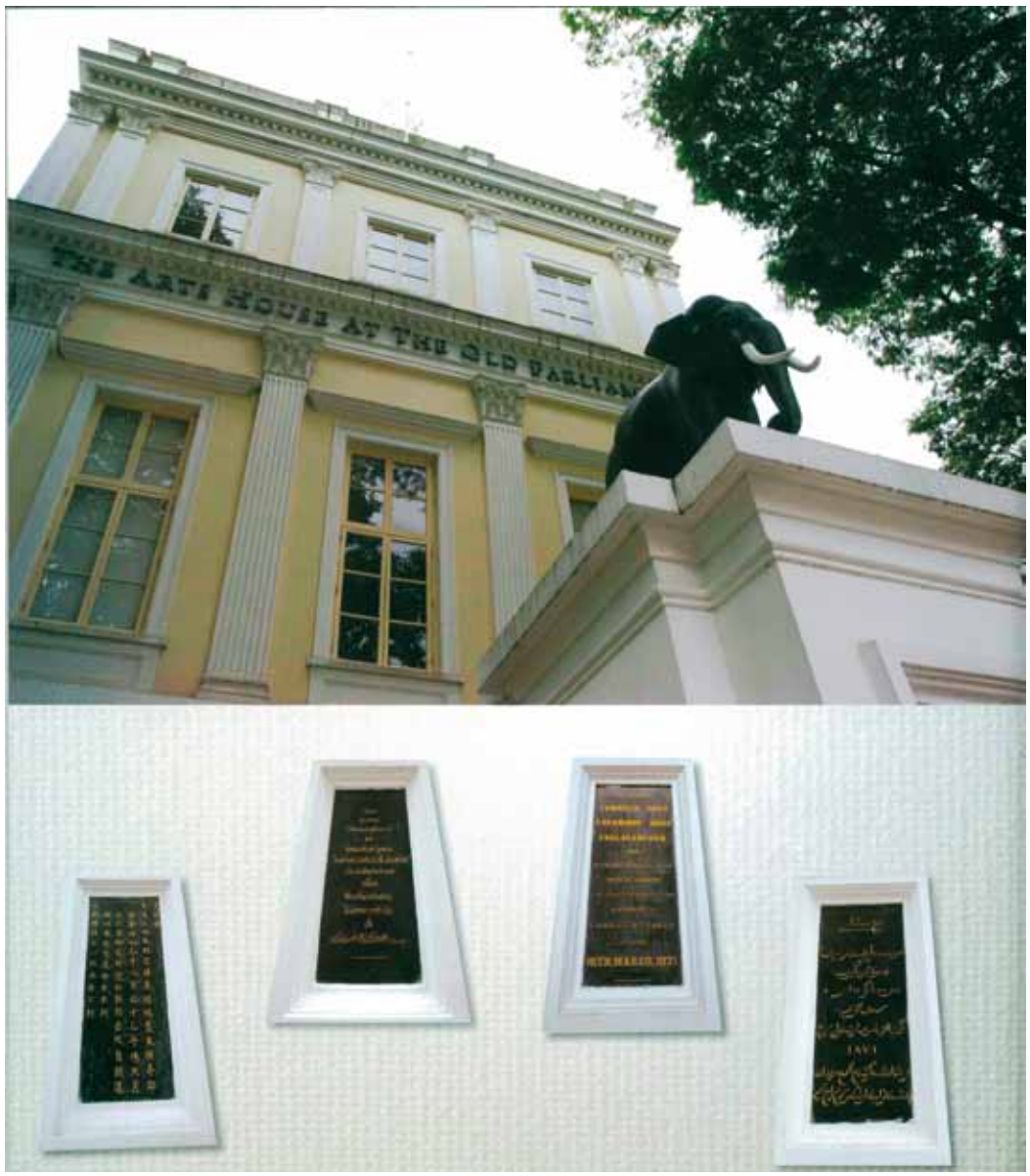
The bronze elephant, presented to Singapore by King Chulalongkorn in 1872 as a memento of his first visit, now in front of the Arts House, formerly Parliament House, with the inscription in Chinese, Thai, English and Malay.

whom he came into contact. They saw that although young, he was an earnest ruler eager to learn and prepare himself to lead his country into the modern world. The King, on his part, had learnt from his father the value of cultivating the goodwill of British colonial officers whose personal views and personalities, no less than official policy, had a bearing on Siamese interests due to the latitude afforded them by the poor communication system of the time.<sup>51</sup> Apart from the opportunity of becoming