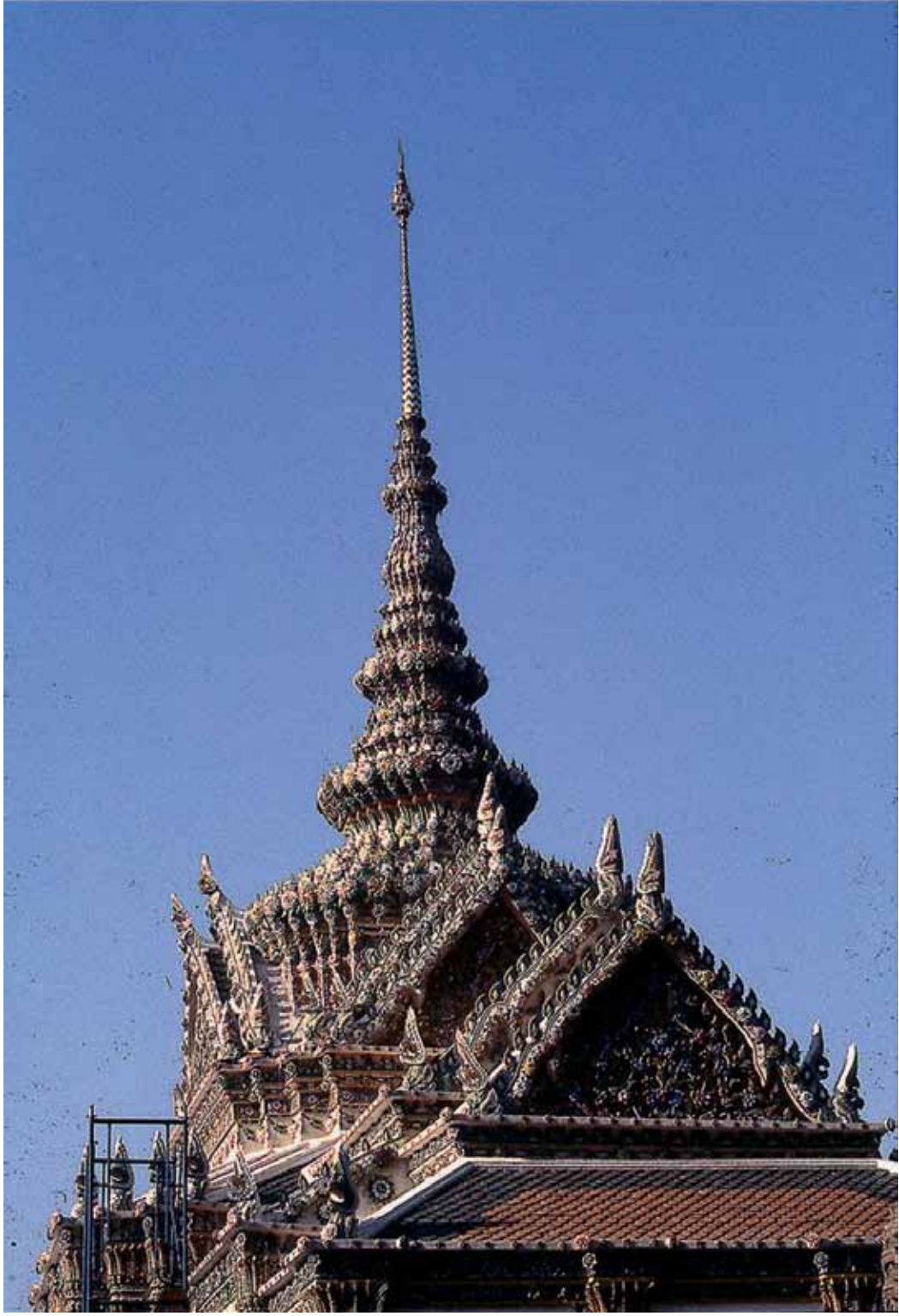
Figure 4. The Wihan Yot, Wat Phra Si Rattana Sassadaram, Bangkok, 1832