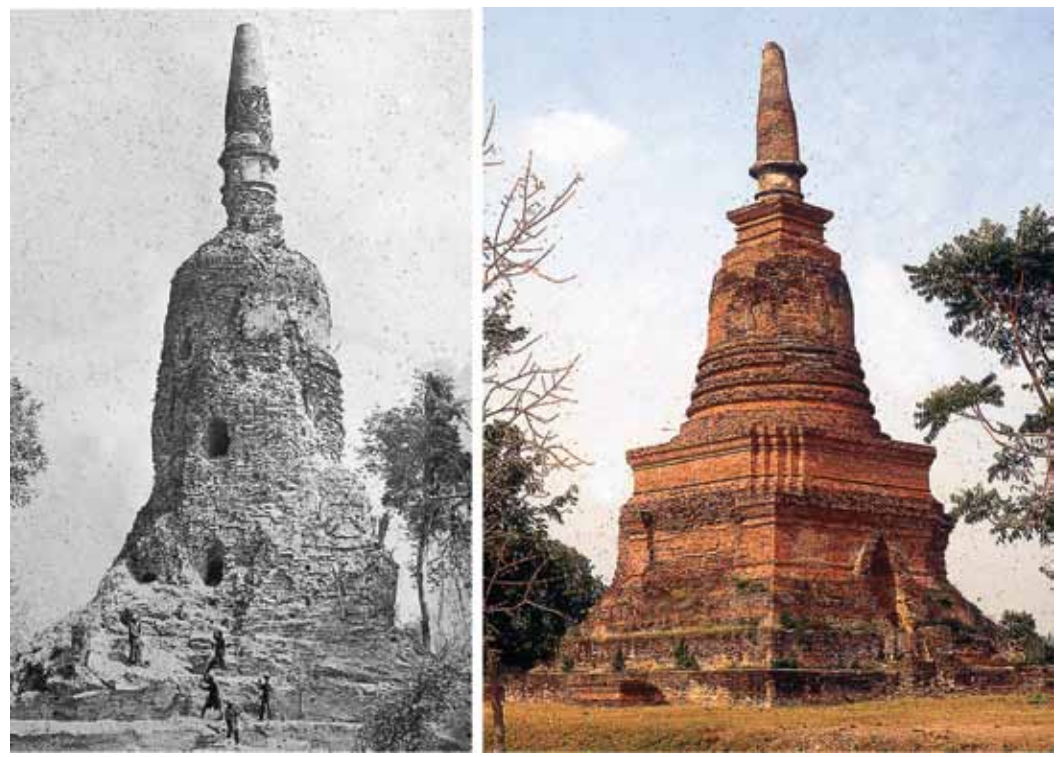
Figure 7. The Chedi of Wat Si Pichit Kirti Kalyaram, Sukhothai, before restoration in 1965 and after reconstruction in 1983