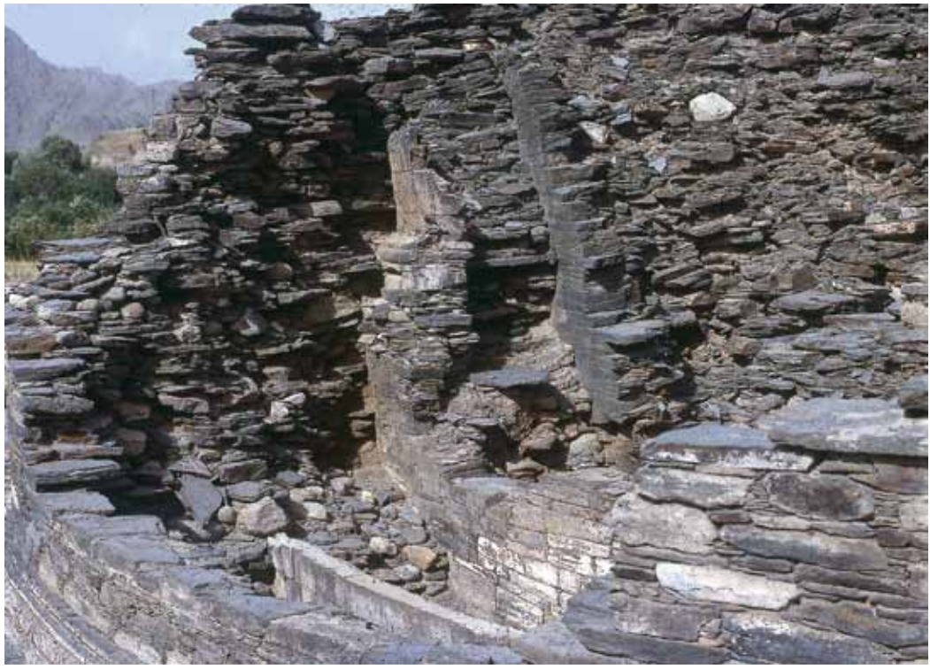
Figure 1. The Great Stupa-I at Butkara, Swat Valley, Pakistan, 3rd BC-10th CE