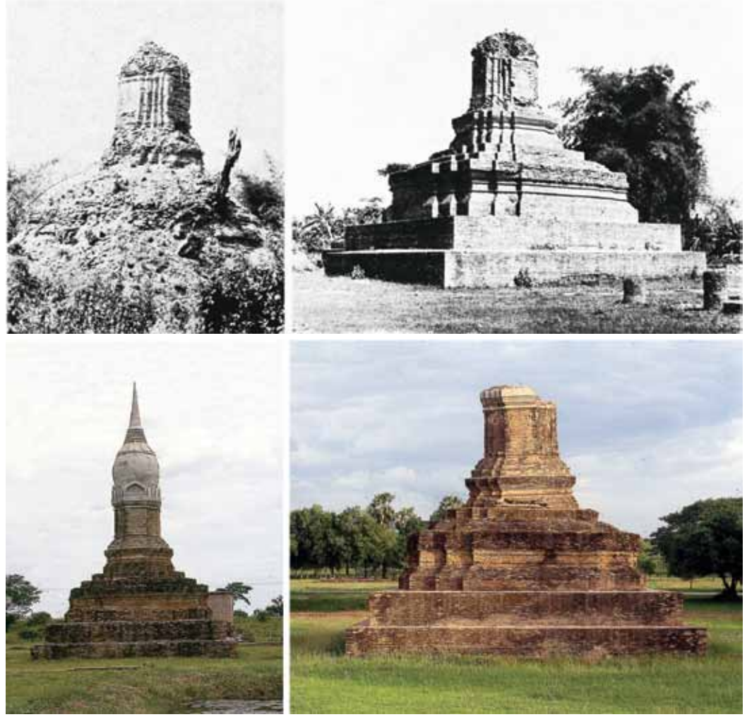
Figure 8. The Chedi of Wat Son Khao, Sukhothai, before and after restoration: (top left) before restoration in 1965; (top right) after restoration in 1965; (bottom left) the reconstruction of the "lotus bud" in 1983; (bottom right) after the removal of the "lotus bud" in 1984

is the opposite of Article 9 in the Venice Charter. Article 4 (3) stipulates that, in the case of a monument that has been restored and the restoration has spoiled the value of the original, the restoration work should be undone and the original building put back in place (Ibid., 99).