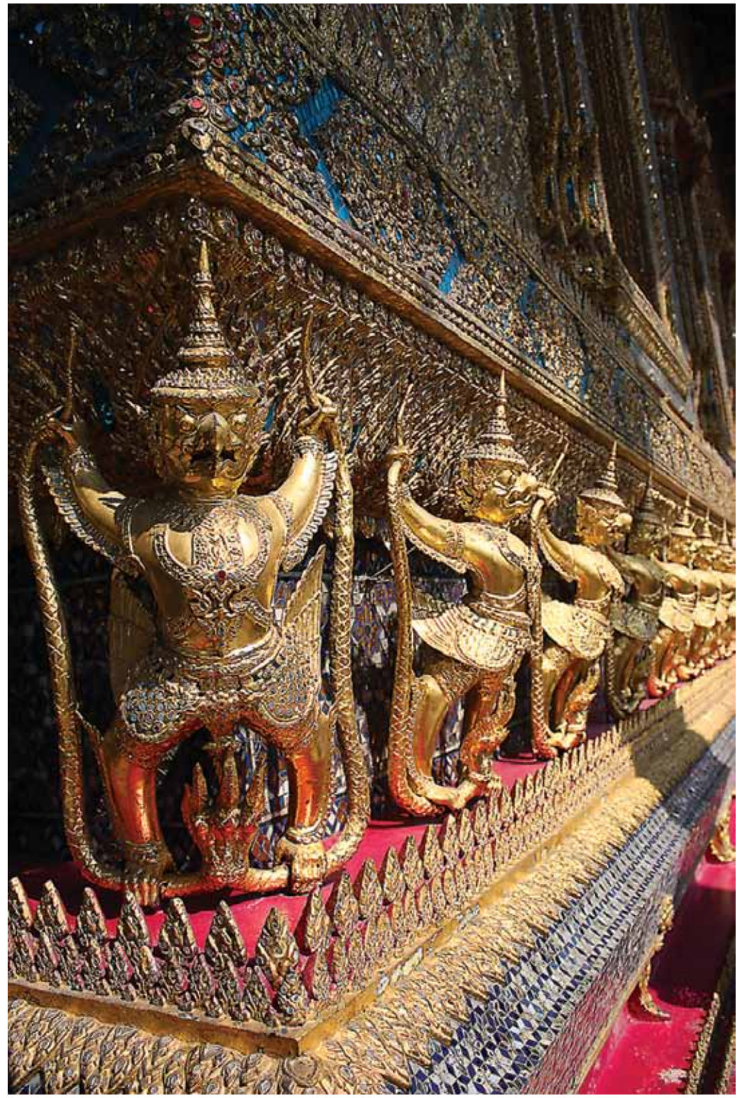
Figure 3. The Ubosot of Wat Phra Si Rattana Sassadaram, Bangkok, 1832