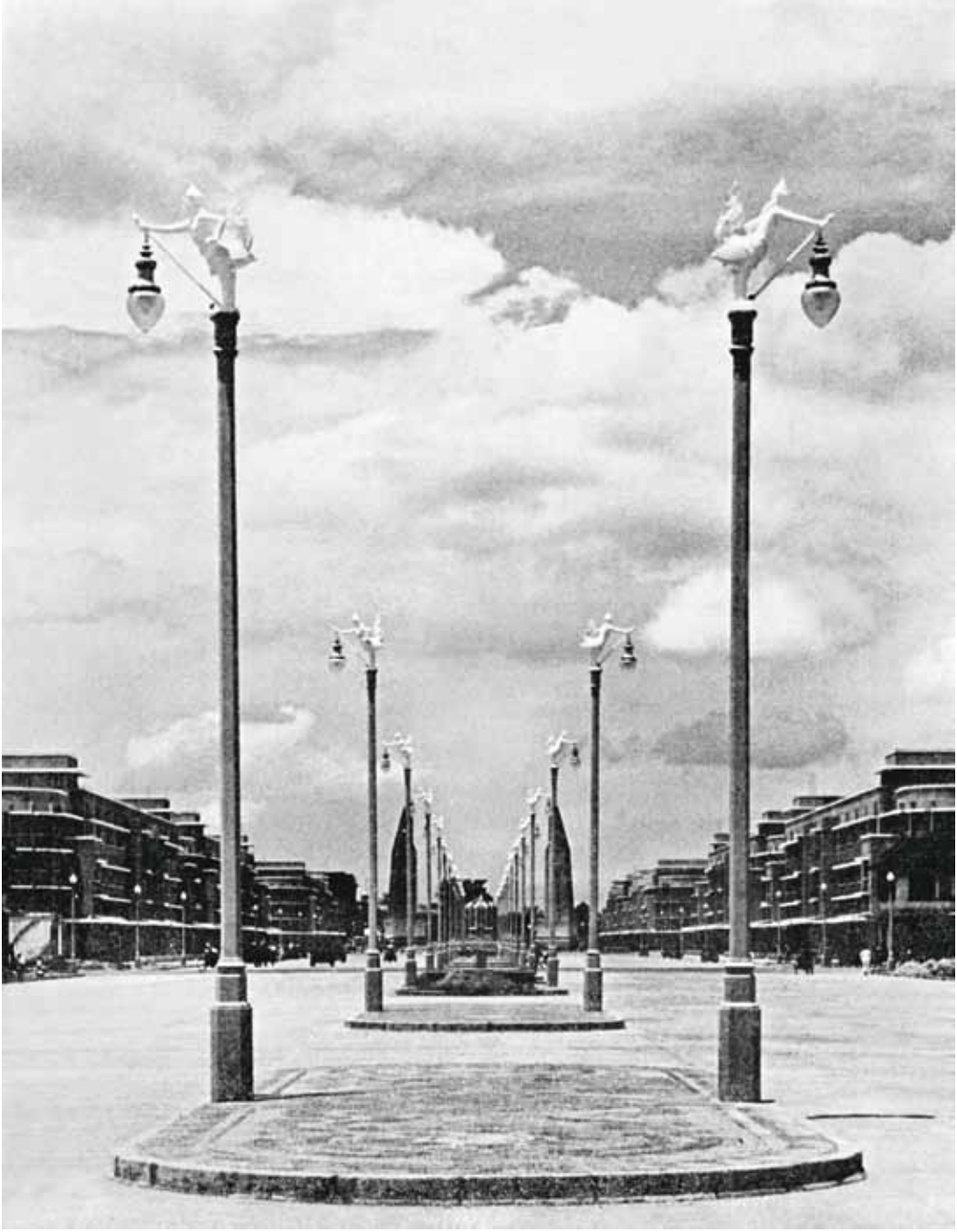
Figure 9. Ratchadamnoen Avenue in 1941

1941 for Ratchadamnoen Avenue (see Figure 9). However, because of ideological differences there were some who advocated demolishing all Phibun-era buildings in the inner city (Chatri 2552, 203).