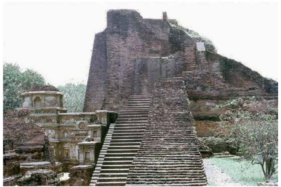
Figure 2. The Vihāra at Site No.3, Nālanda, Bihar, India, 3rd BC-12th CE