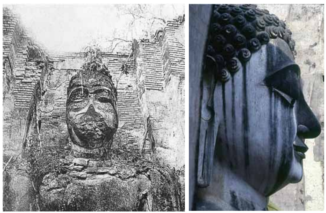
Figure 6. The Phra Acana Image, Wat Si Chum, Sukhothai, before and after restoration: (left) photograph taken c. 1892; (right) after restoration in 1953