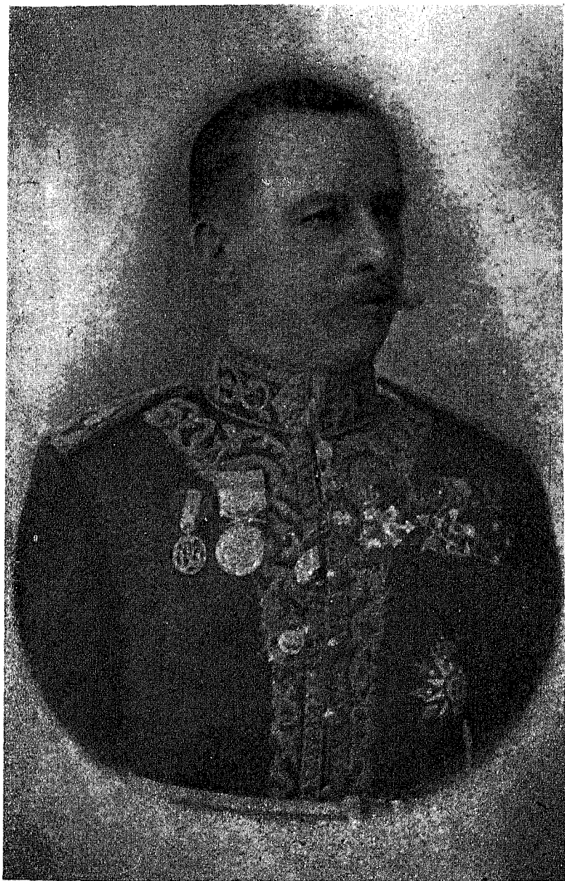
2.-DR. E. REYTTER ( PHYA PRASIRTSATR DAMRONG ), physician to King Chulalongkorn from 1895 until the King's demise ( 1910 ).