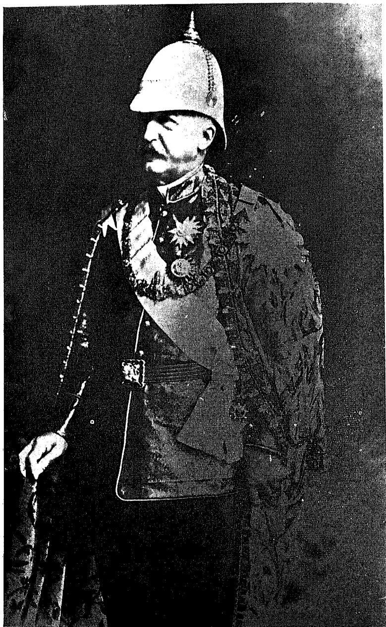
1.-ROLIN-JAEQUEMYS (CHAO PHYA APHAY RAJA ), General Advisor to the Siamese Government ( 1892-1902 ).