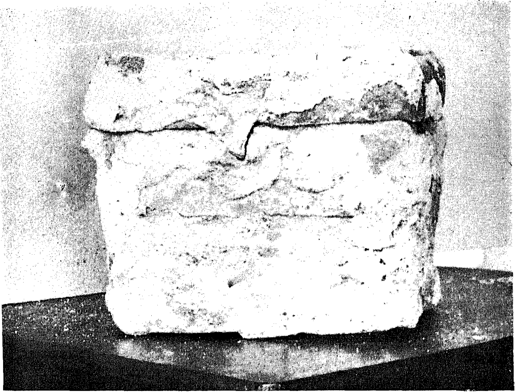
1. The Pondicherry copper casket, a cube measuring 9 \times 9 \times 9 inches approximately, and at present kept in the Pondicherry public library.