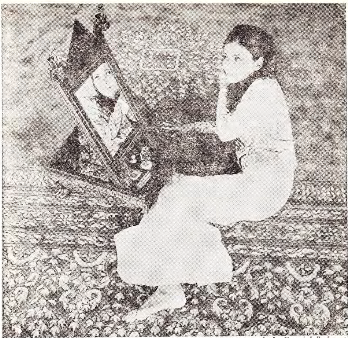
ร้านสุกักร้า พิจิตรภัณฑ์ เอ็มไอเคอร์มงคล