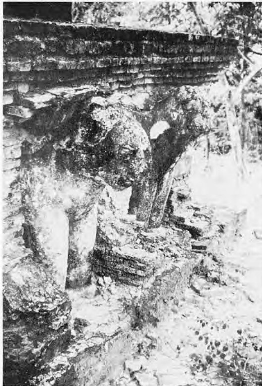
Figure 4. Elephant at the elephant-surrounded stupa at Wat Chāng Rōp, Sukhothai.