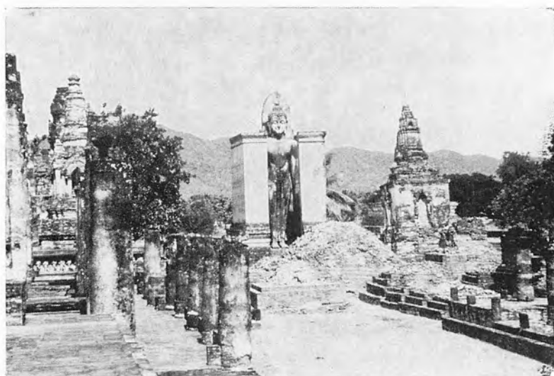
Figure 7. “Phra Atthārat”: an eighteen-cubit Buddha image at Wat Mahāthāt, Sukhothai.