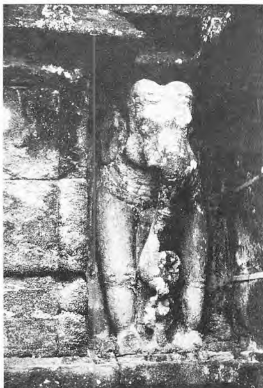
Figure 5. One of elephants surrounding the stupa at the Gadala Deniya Temple near Gampola, Sri Lanka.