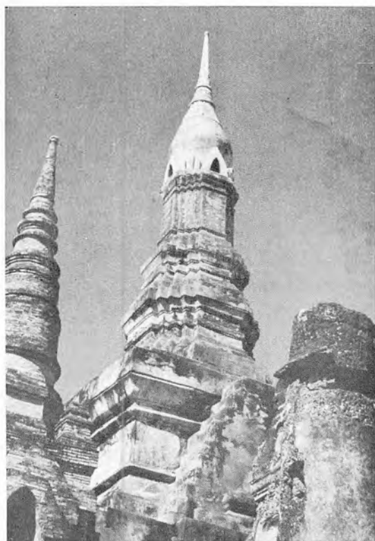
Figure 1. Main \check{c}h\acute{e}d\acute{i} , Wat Mahāthāt, Sukhothai.