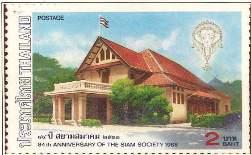
The 84th Anniversary of the Siam Society commemorative postage stamp.