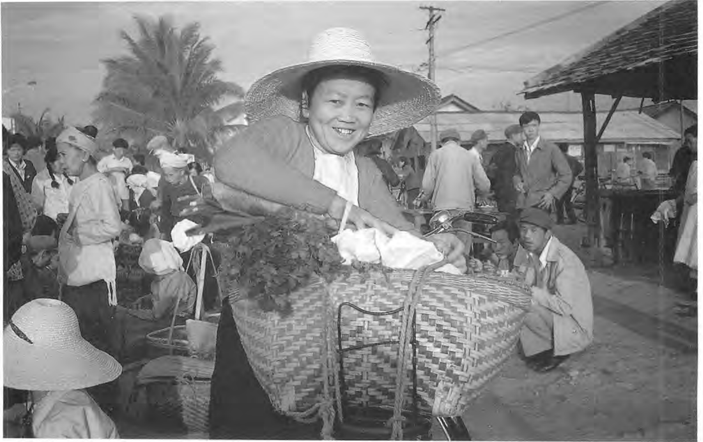
A Tai vegetable vendor with typical baskets in Xishuangbanna.

tions. This shows that the entrenched domination of the House of Duan in Dali ended indeed in "migration" — not in migration to the south, but in migration to the north.