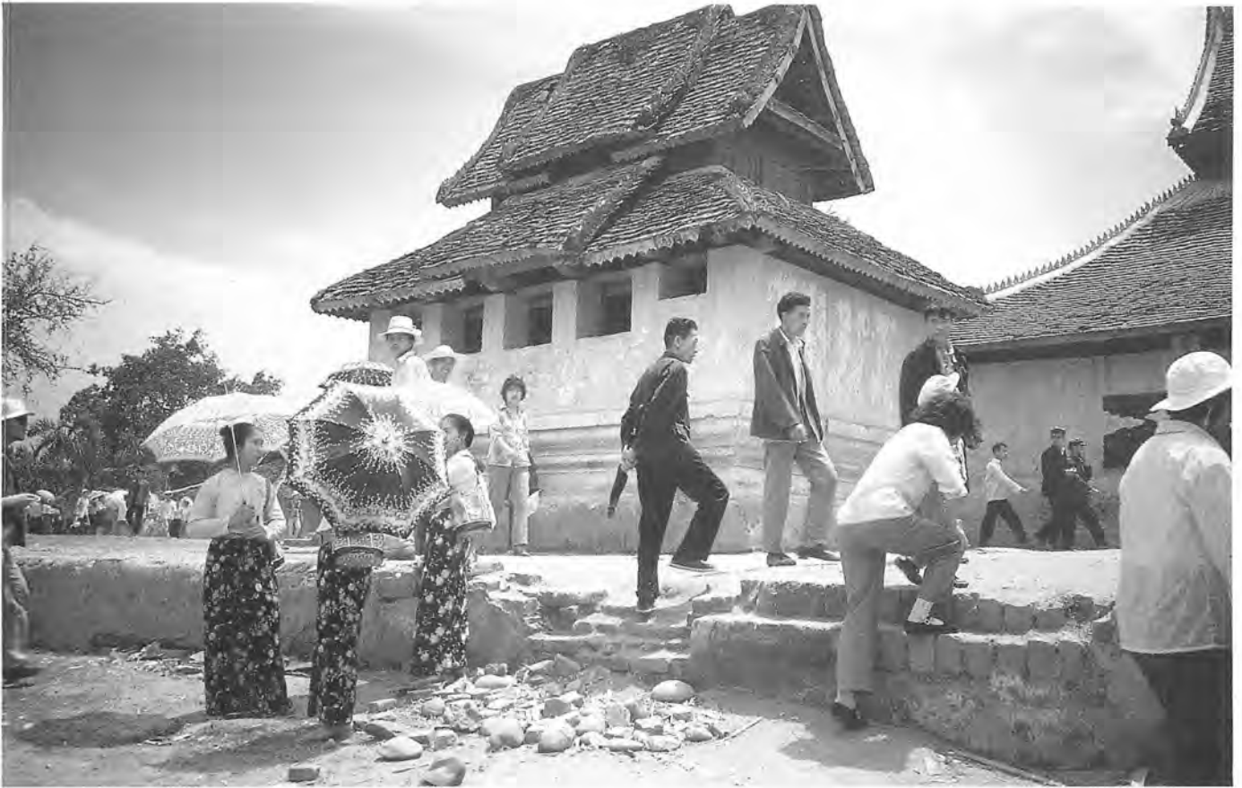
Tai architecture in Xishuangbanna.

as its center. According to historical records, this regime "regarded the Emperor of the Chinese heavenly dynasty as their common lord," 25 and had some subordinate relationships with the Chinese interior. This indicates that the history of the Tai people has developed in keeping with the inevitable laws of social development.