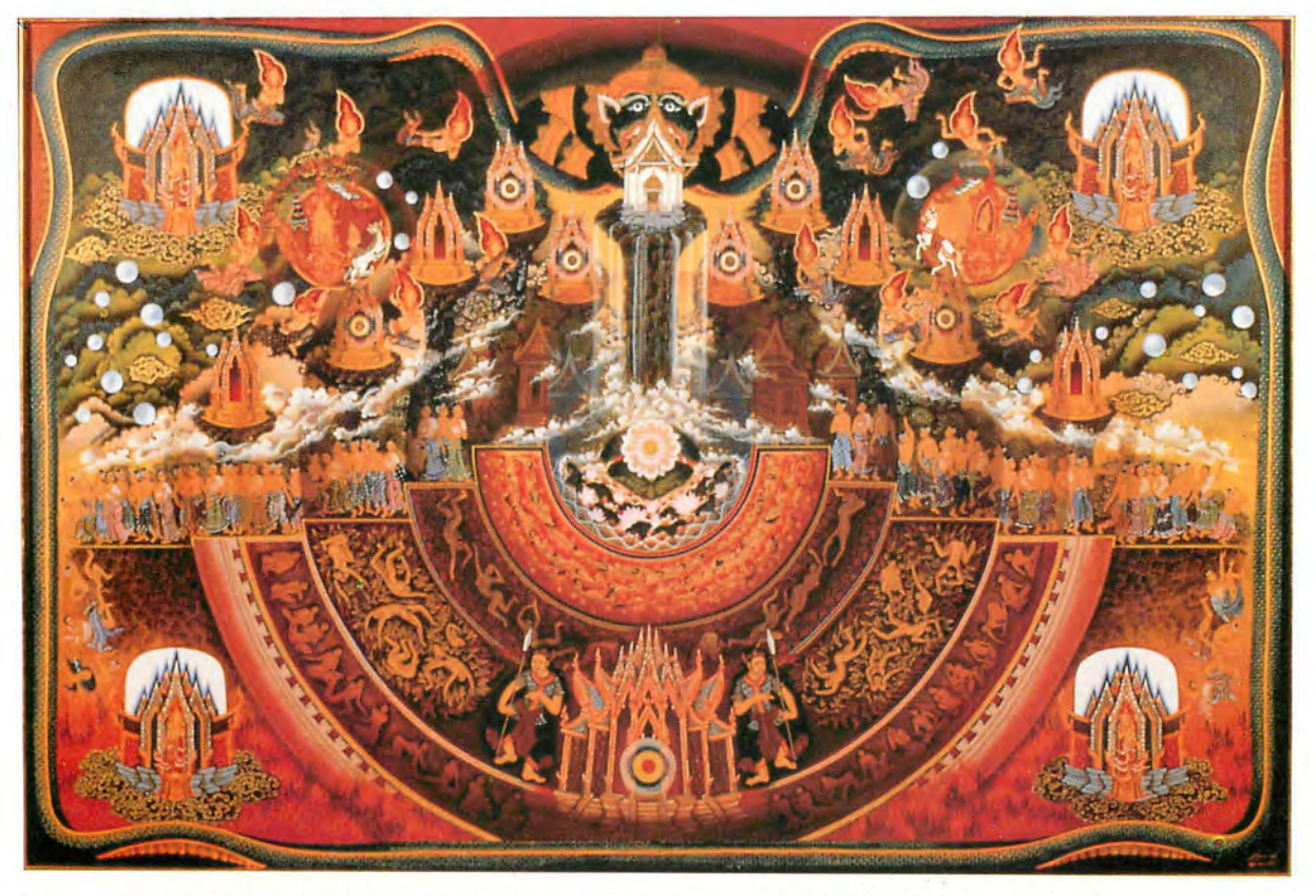
"Lotus at the Centre of the Universe," by Prasat Seri. Heaven, Earth and the Underworld (p. 50).