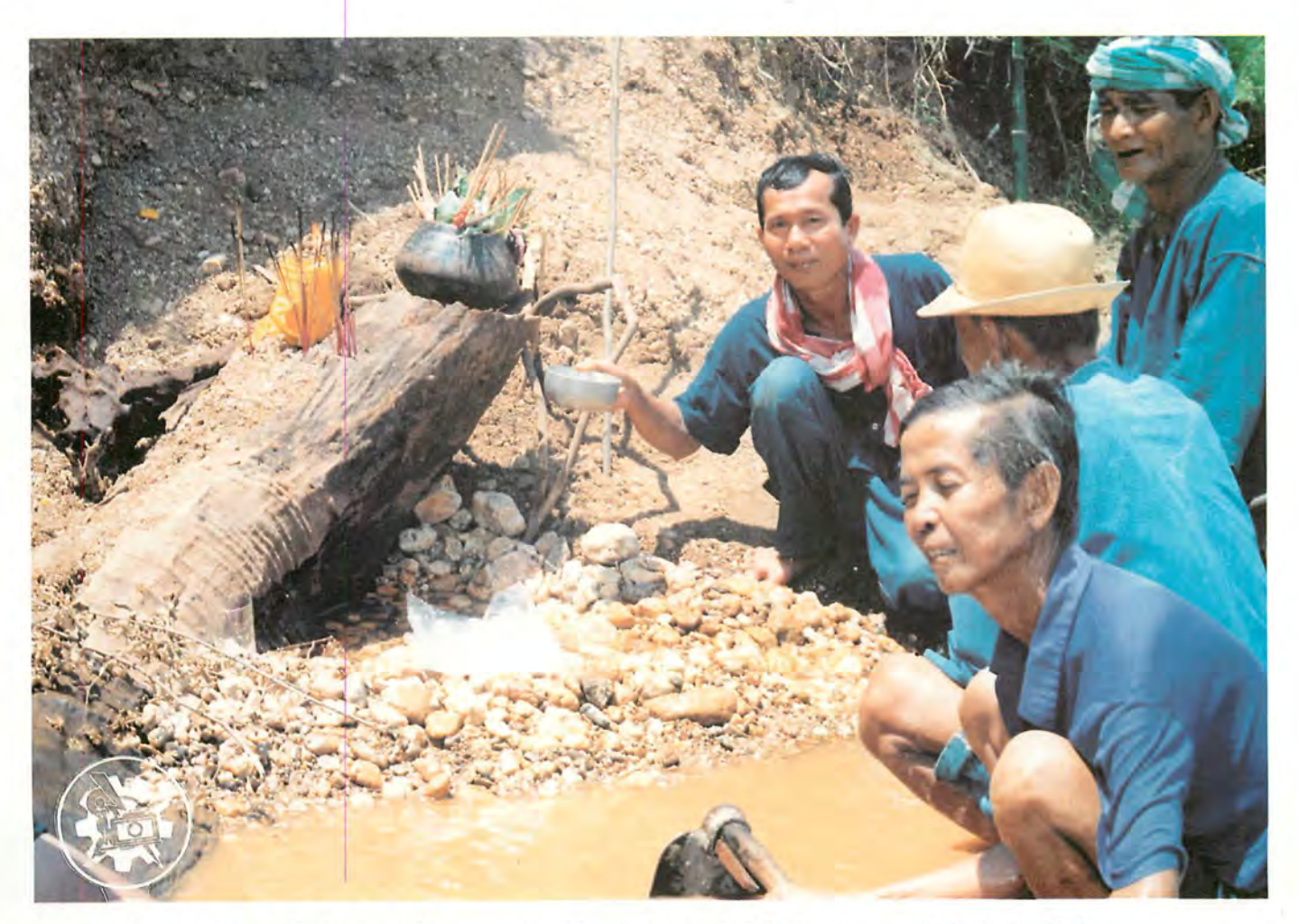
Villagers identify a Door to the Underworld, source of health and plenty. Thai Rath Newspaper, 14 September 1989.

A Westerner might at first dismiss this behaviour as a manifestation of ignorance, superstition and a degradation of Buddhist rationalism.