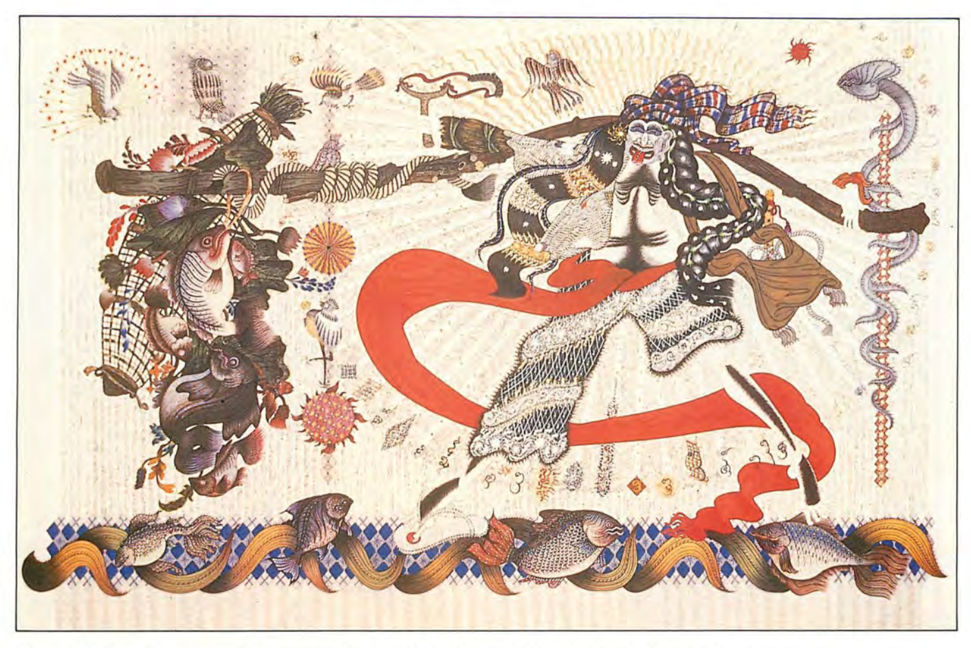
"Heaven's Decree," by Prasong Luemuang. The theme is fertility, symbolized by the fish. A corpse-like figure, gushing blood, dances like Shiva with an Axis Mundi to left and right (p. 50).