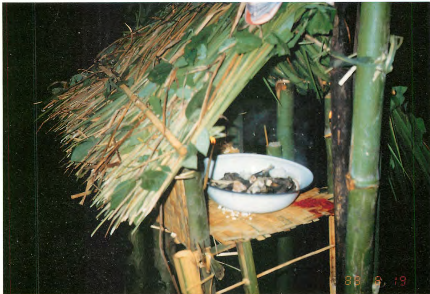
Fig. 4 Offerings in the lō ta : rite. 1. Procedures, f).

Both rites for the Supreme 'owner' and for the Guardian Deity are characterized by a ritual communion of the family with the supernatural powers through offerings, but distinct differences in offerings can be observed.