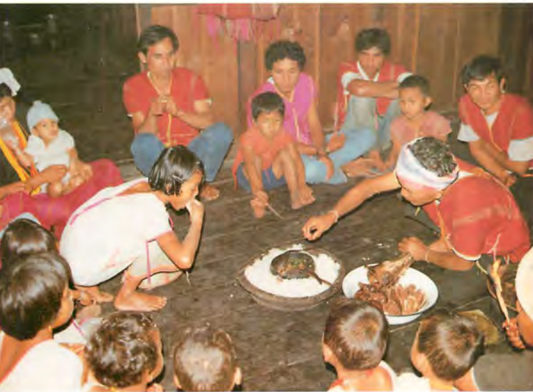
Fig. 1 Commune in the \alpha : x\epsilon rite. 3. Procedures, 8).