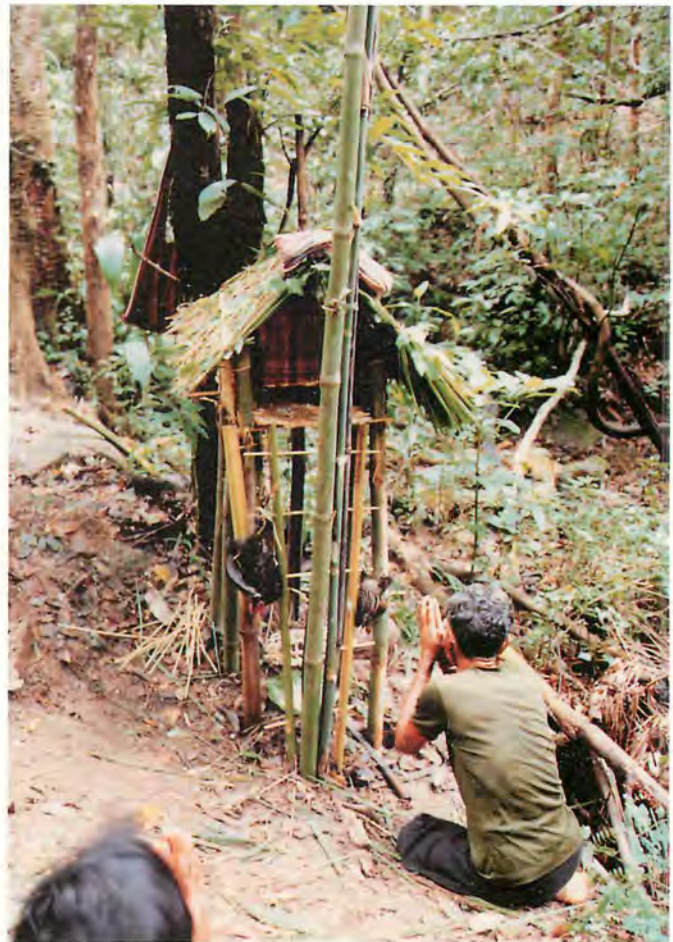
Fig. 3 Prayer in the lō ta : rite. 1. Procedures, d).