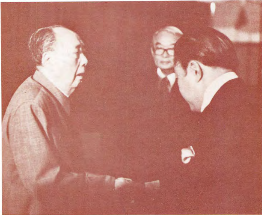
Mao Zedong and Mr. Prakaipet exchange greetings as Prime Minister M.R. Kukrit Pramroj looks on.