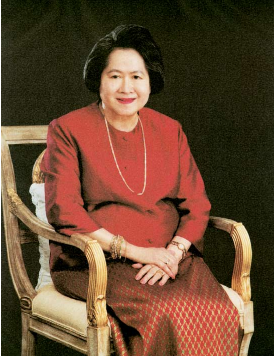
This volume is respectfully dedicated to the memory of Her Royal Highness Princess Galyani Vadhana Krom Luang Naradhiwas Rajanagarinda Vice-Patron and Honorary President of the Siam Society 1985 – 2008