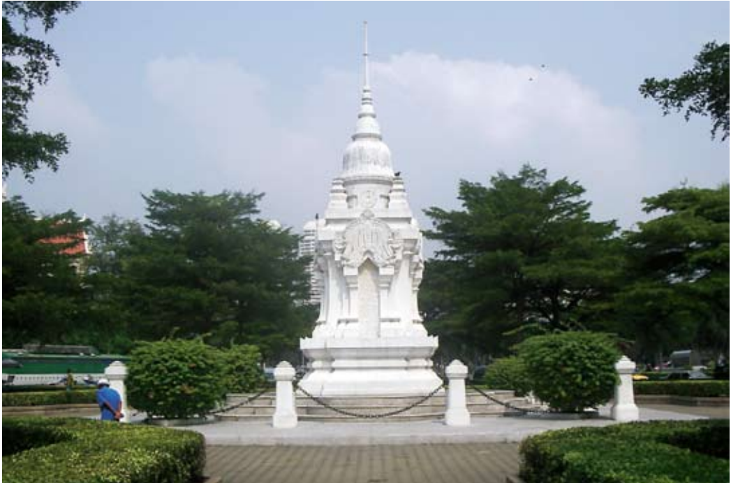
Figure 1: Volunteer Soldiers' Monument, Sanam Luang, Bangkok, January 2007