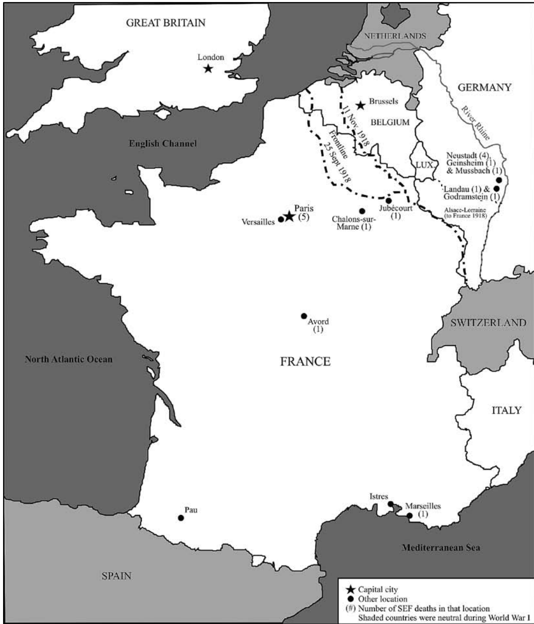
Figure 3: Map of locations mentioned in the text