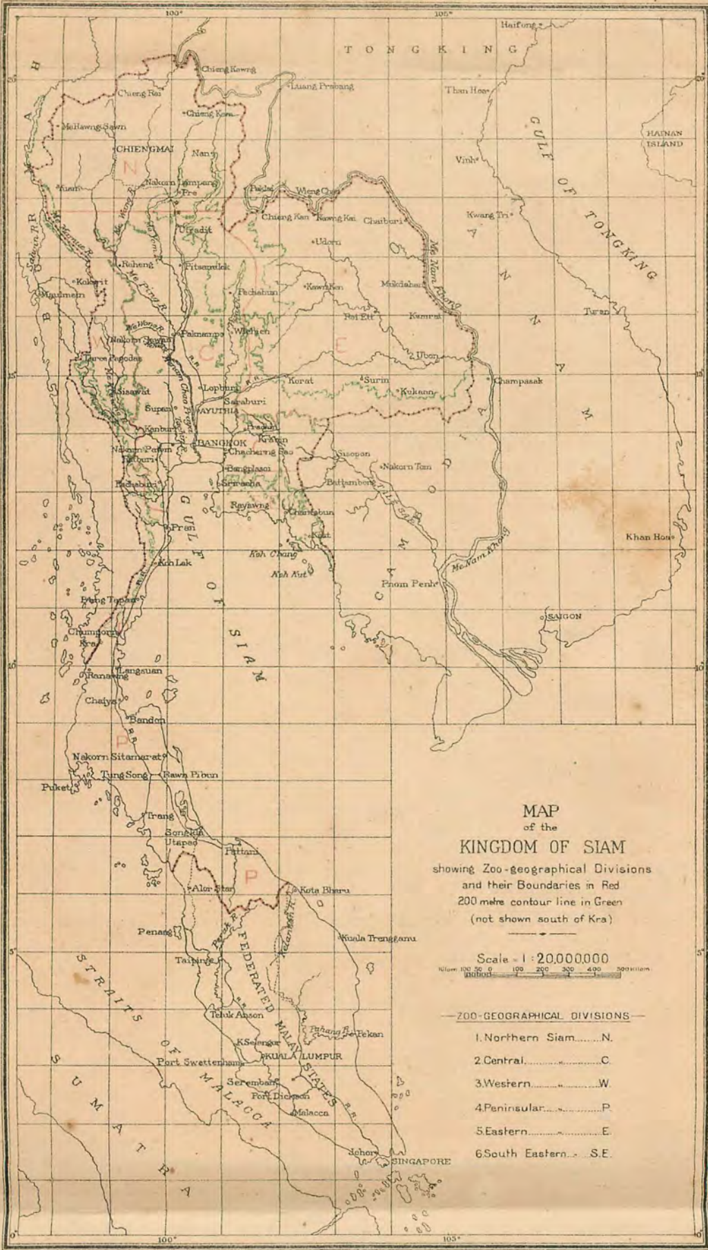
MAP of the KINGDOM OF SIAM showing Zoo-geographical Divisions and their Boundaries in Red 200 metre contour line in Green (not shown south of Kra)

Scale - 1 : 20,000,000 Kilom 100 200 300 400 500 Kilom. Miles 60 120 180 240 300 Miles