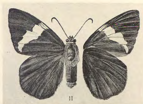
RHOPALOCERA FROM SIAM.