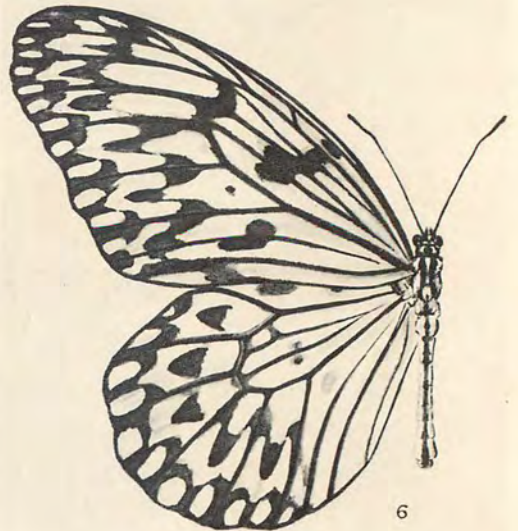
RHOPALOCERA FROM SIAM.