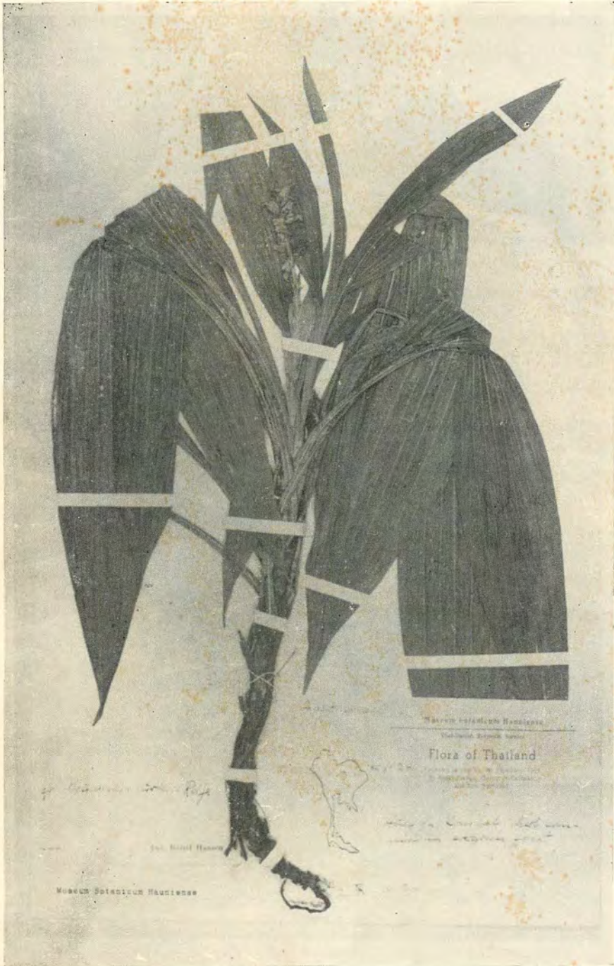
Fig. 1. Neuwiedia singaporeana from Phu Mieng.