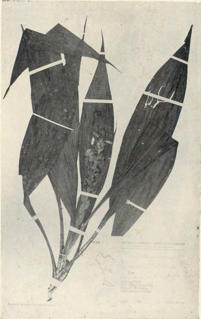
Fig. 2. Neuwiedia singaporeana from Lom Sak.