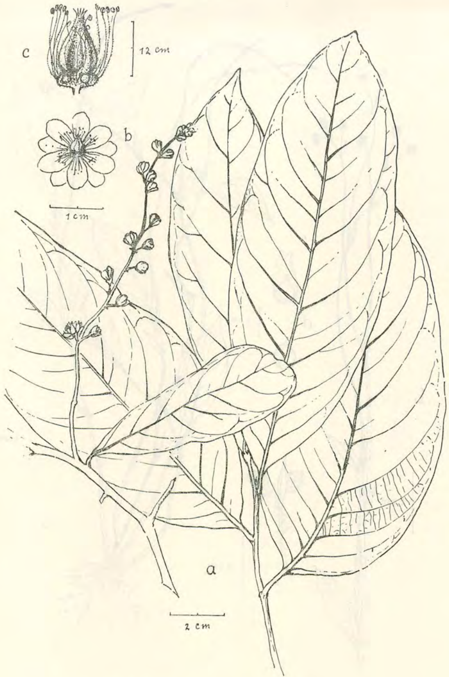
Fig. 2 Homalium damrongianum Craib a. Flowering twig; b. Flower (enlarged); c. Stamen and ovary (enlarged).