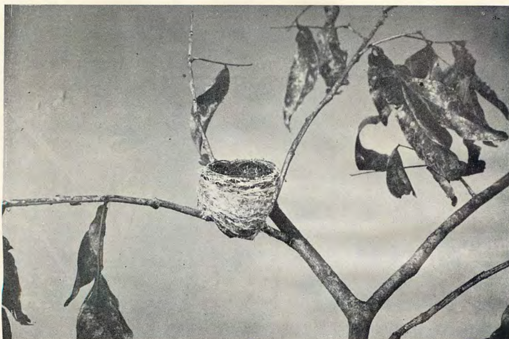
Fig. 1. Nest of Rhipidura javanica , Fantail Flycatcher.