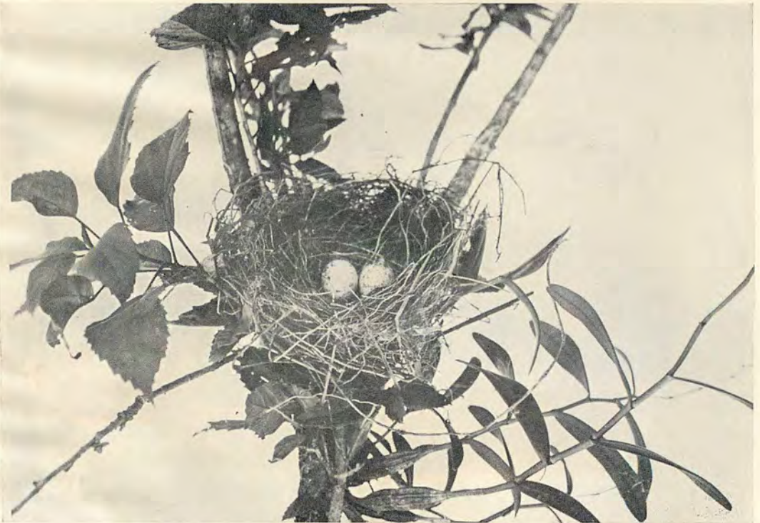
Fig. 2. Nest and eggs of Lanius schach bentet , Grey-backed Shrike