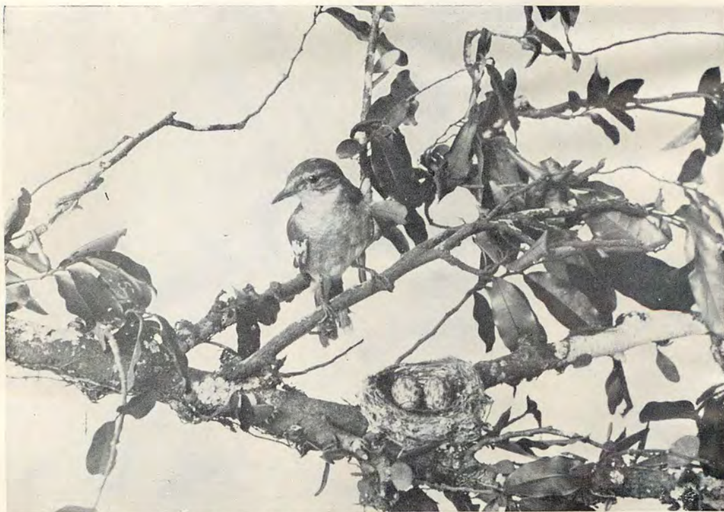
Fig. 2. Lalage nigra , Pied Cuckoo-Shrike (in this case a stuffed bird) with nest and eggs.