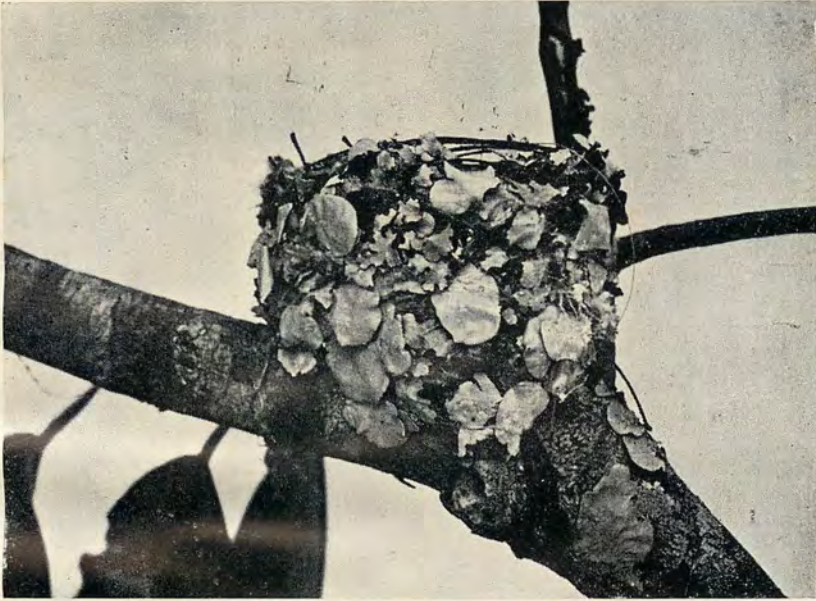
Fig. 1. Nest of Pericrocotus cinnamomeus , Small Minivet.