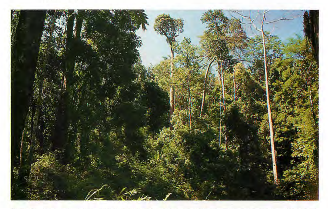
Figure 3. Dry evergreen forest around Khao Nang Rum Research Station in Huai Kha Khaeng Wildlife Sanctuary.