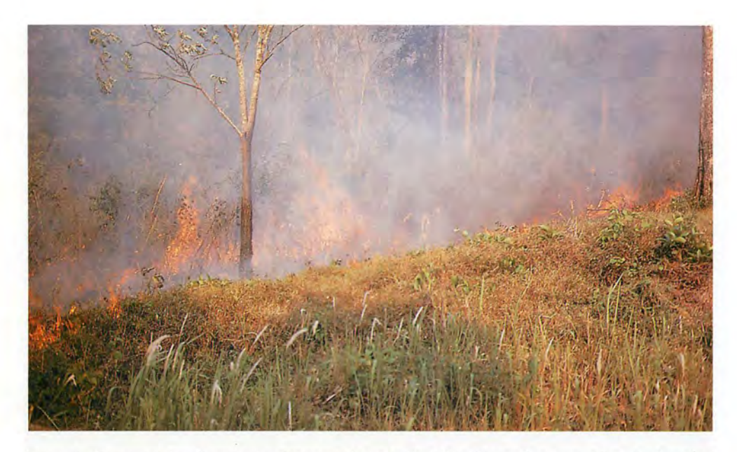
Figure 4. Dry season fires burning dry dipterocarp forest in Huai Kha Khaeng Sanctuary.