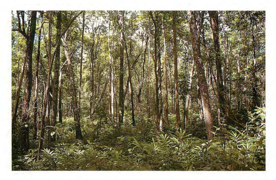
Figure 2. Fire-influenced dry dipterocarp forest in Huai Kha Khaeng Wildlife Sanctuary.