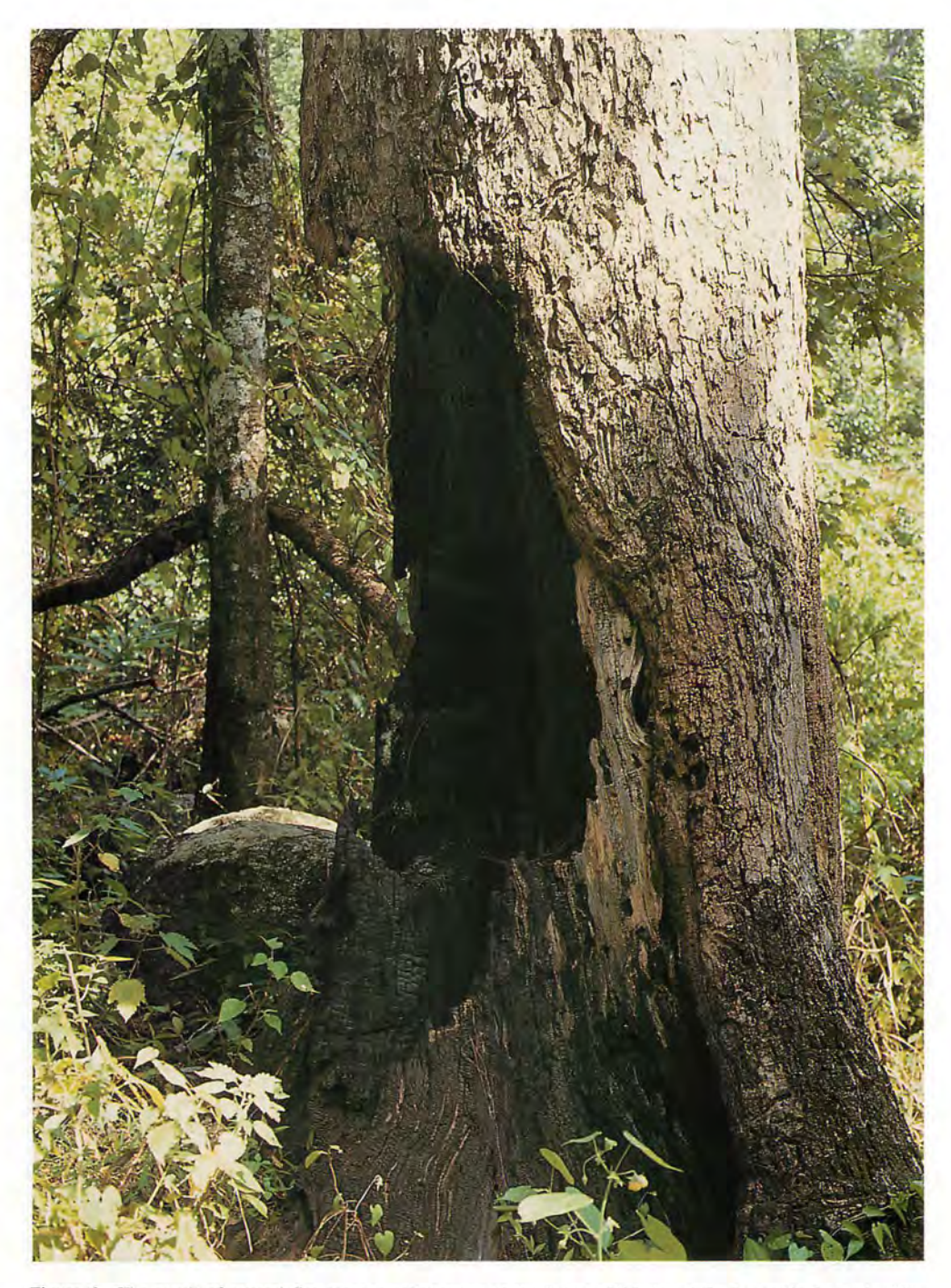
Figure 6. The result of several fire seasons eating away at the "yang oil" holes at the base of a large, healthy dipterocarp.