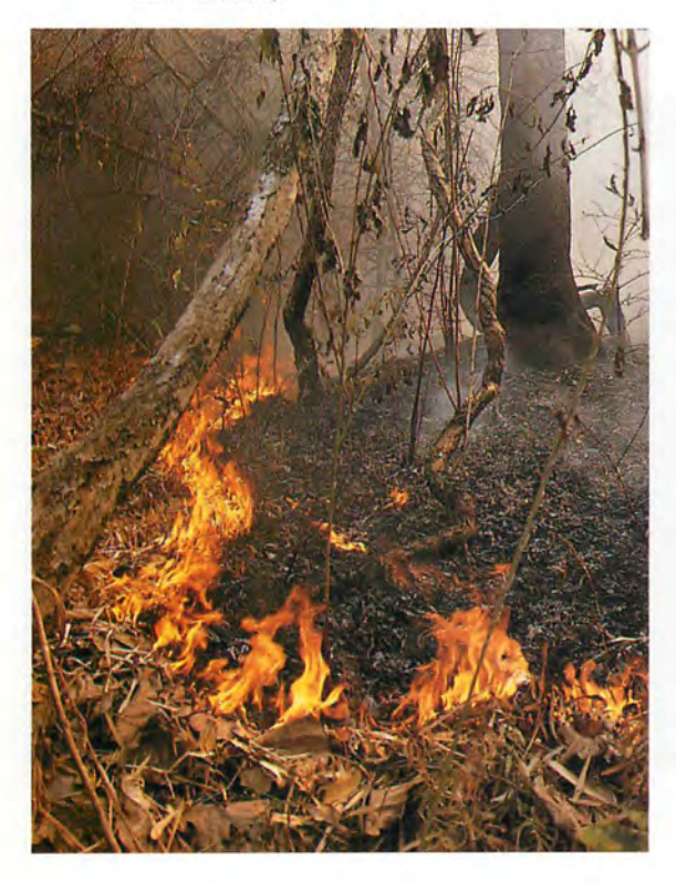
Figure 5. An advancing ground fire in dry dipterocarp forest in Huai Kha Khaeng Sanctuary.

Figure 4. Dry season fires burning dry dipterocarp forest in Huai Kha Khaeng Sanctuary.