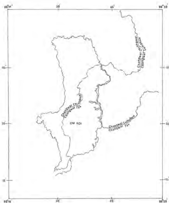
Figure 2. Map of Om Koi Wildlife Sanctuary, Chiang Mai and Tak provinces.