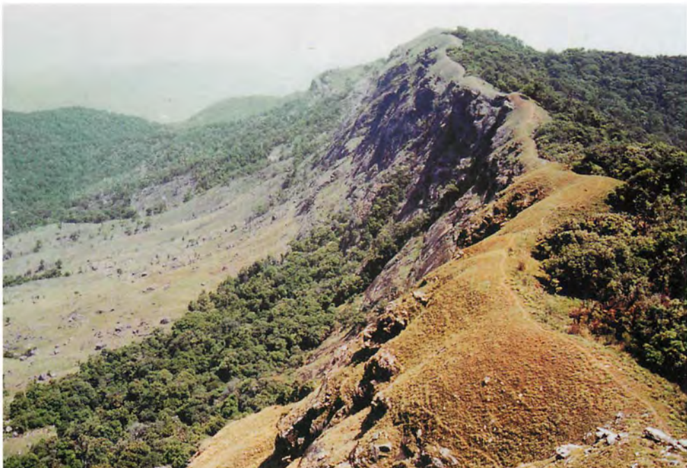
Figure 4. Habitat site of goral in western Doi Mon Jong.