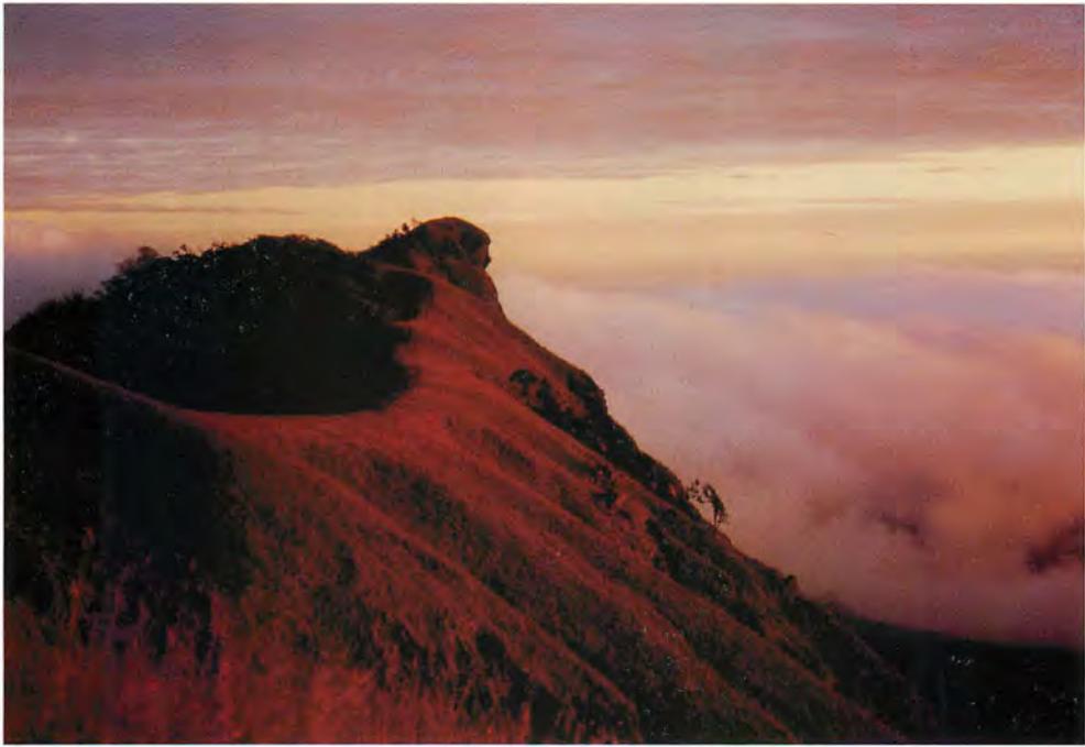
Figure 3. Doi Mon Jong, habitat of the goral.