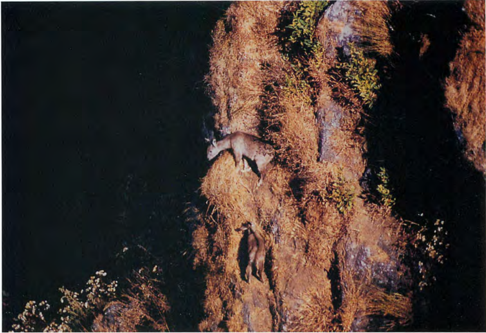
Figure 5. Female goral and its infant.