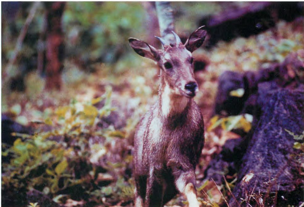
Figure 6. General characteristics of goral.