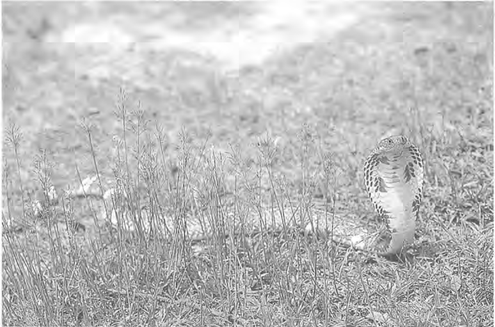
Figure 1. Frontal view of Indo-Chinese Spitting Cobra Naja siamensis photographed captive in a village near Dong Phou Vieng National Biodiversity Conservation Area, Savannakhet Province, central Laos.