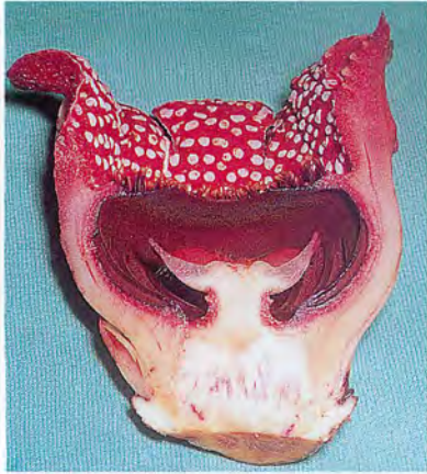
Figure 3. Cross section of female Sapria himalayana f. albovinosa f. nov.