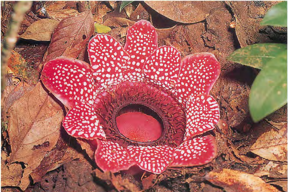
Figure. 2. Male Sapria himalayana f. albovinosa f. nov.; size 10x11 cm. Note the typically red male disk.