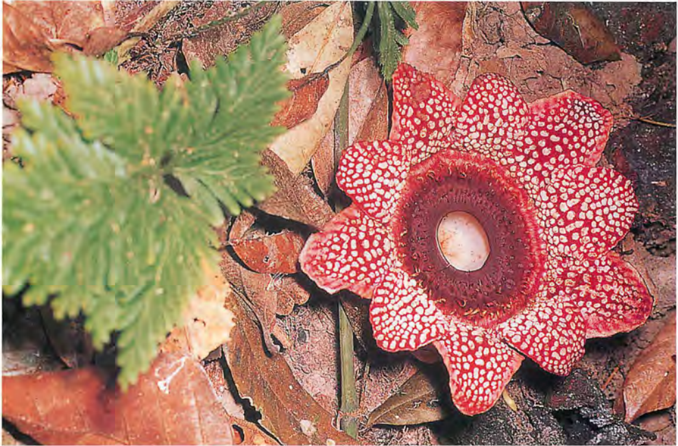
Figure. 1. Female Sapria himalayana f. albovinosa f. nov.; size 11x12 cm. Note the typically pale female disk.