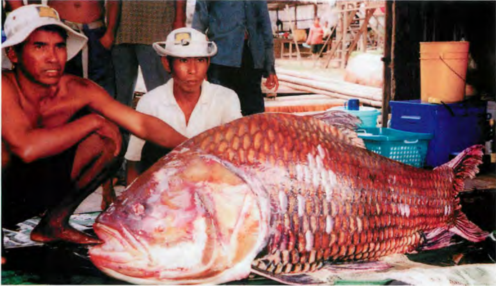
Figure 4. An 85-kg giant carp from bagnet unit 2D. This fish was caught on November 21, 2000, and measured 1.62 m total length. This fish was successfully re-released into the Tonle Sap River.