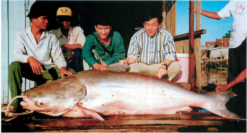
Figure 2. A Mekong giant catfish captured October 24, 2000 in bagnet unit 2B. This fish weighed 171 kg and measured 1.71 m total length.