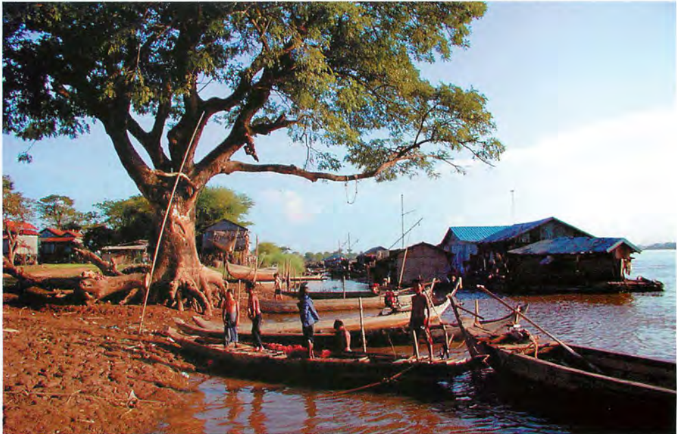
Figure 7. The Tonle Sap River. The floating houses of the bagnet owners can be seen along the river bank. These floating houses serve as holding areas for fish caught in the bagnet and also as landing sites where fish are sorted, stored, and then later sold.