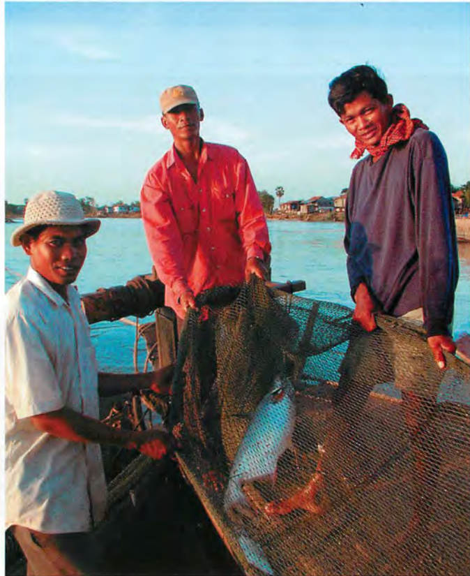
Figure 5. Three fishermen lift a bagnet to clear it of fish. A medium-size Pangasius larnaudei can be seen inside the net.