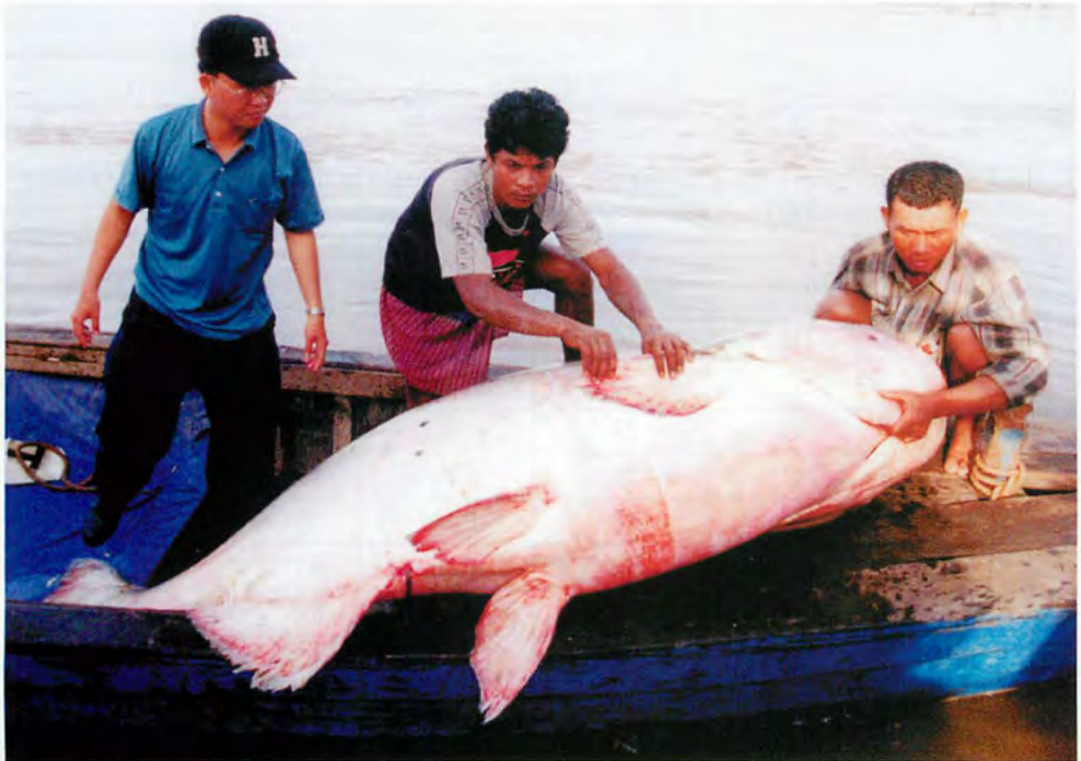
Figure 3. One of the largest Mekong giant catfish caught in Cambodia in 2000. This fish weighed 268 kg and measured 2.64 m total length. Here, the fish is being returned to the Tonle Sap River after tagging.