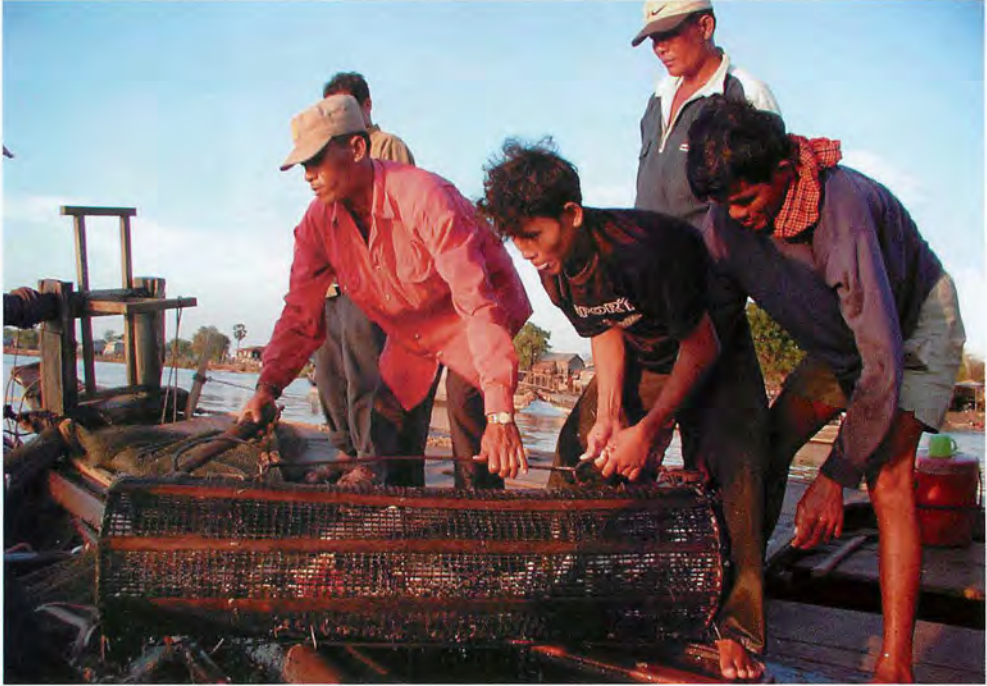
Figure 6. Fishermen preparing to empty the bagnet basket into a boat for transport to the landing site. This basket is attached to the bagnet at the far downstream end of the funnel-shaped net.