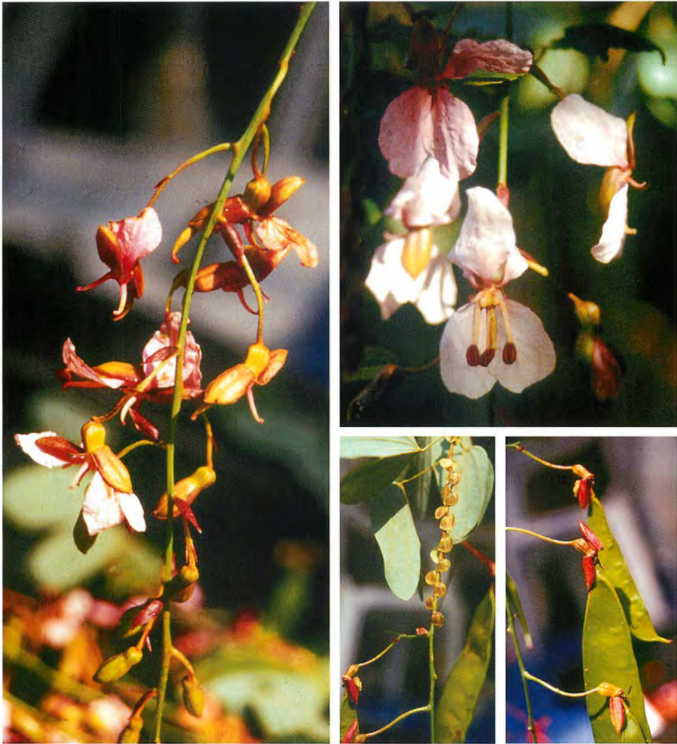
Figure 1. Bauhinia siamensis . Left, Inflorescence; upper right, flowers; lower middle, base of inflorescence showing stipules; lower right, young pods. Photos by T. Wongprasert, from type locality.