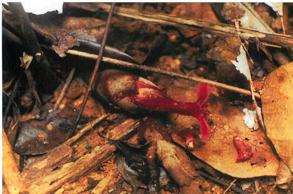
Figure 7. Hornstedtia conica Ridl.