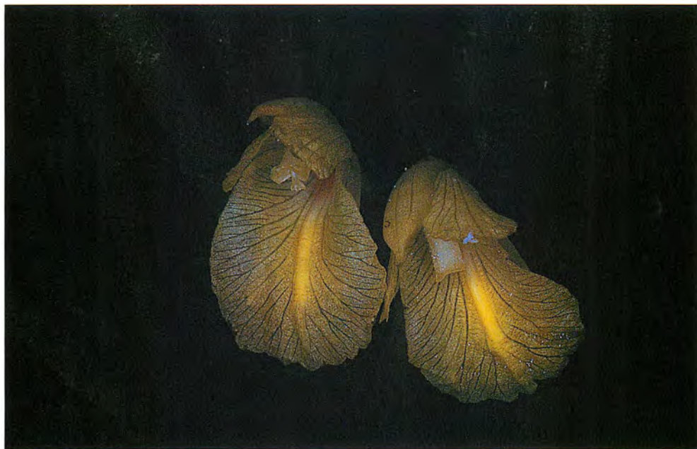
Figure 1. Boesenbergia flava (Ridl.) Holtt.