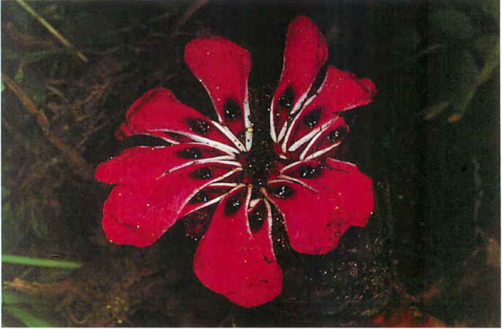
Figure 3 Etilingera metriocheilos (Griff.) R.M. Smith