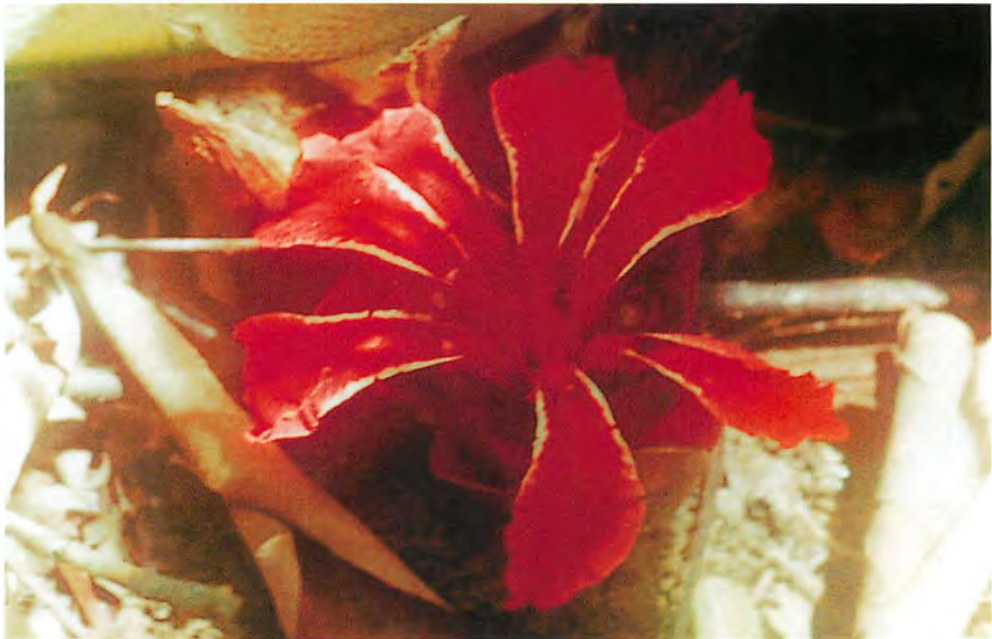
Figure 6. Etlingera triorgyalis (Bak.) R.M. Smith