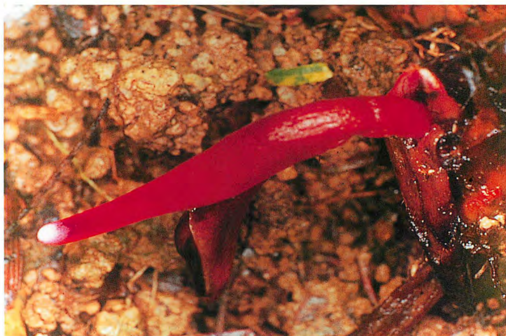
Figure 8. Hornstedtia leonurus (Koenig) Retz.