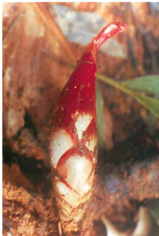
Figure 9. Hornstedtia ophiuchus (Ridl.) Ridl.