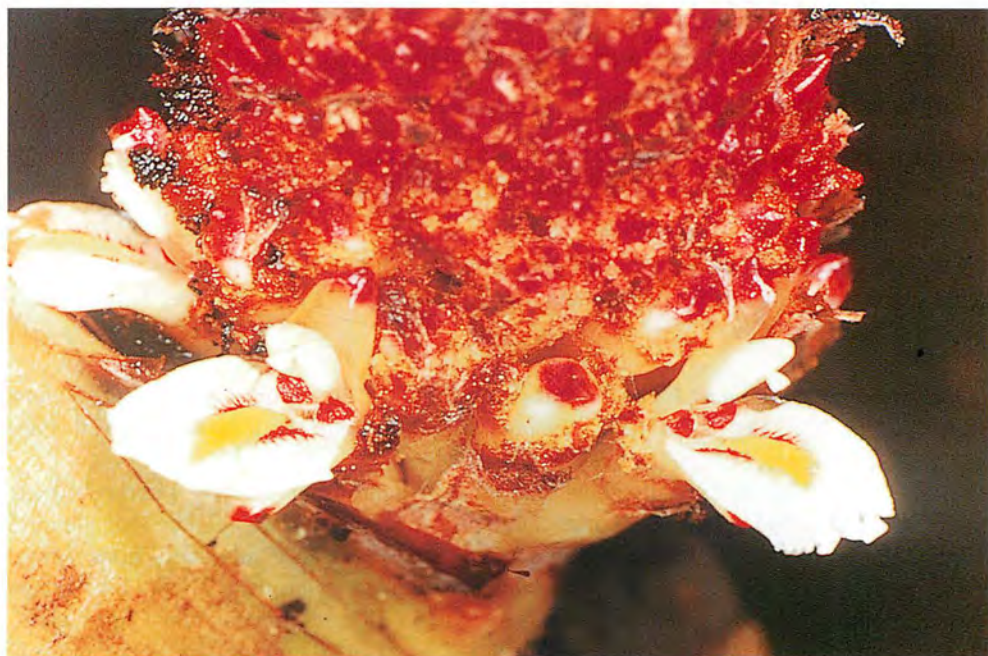
Figure 10. Plagiostachys aff. albiflora Ridl.