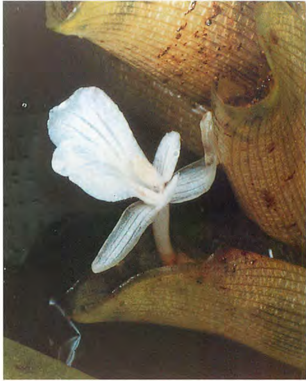
Figure 11. Scaphochlamys perakensis Holtt.

Ecology: In partly shaded area near stream in evergreen forest, c. 200–600 m msl.