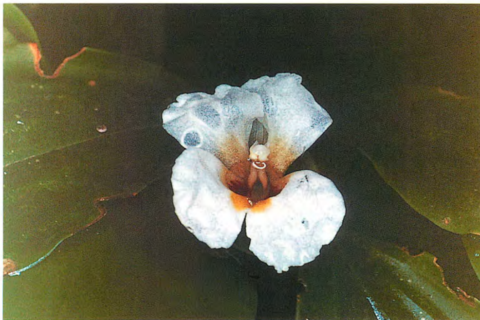
Figure 2. Camptandra parvula (King ex Bak.) Ridl.