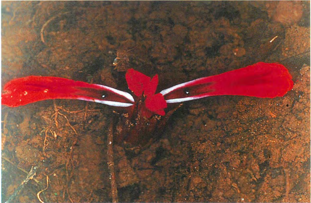
Figure 5. Etlingera subterranea (Holt.) R.M. Smith