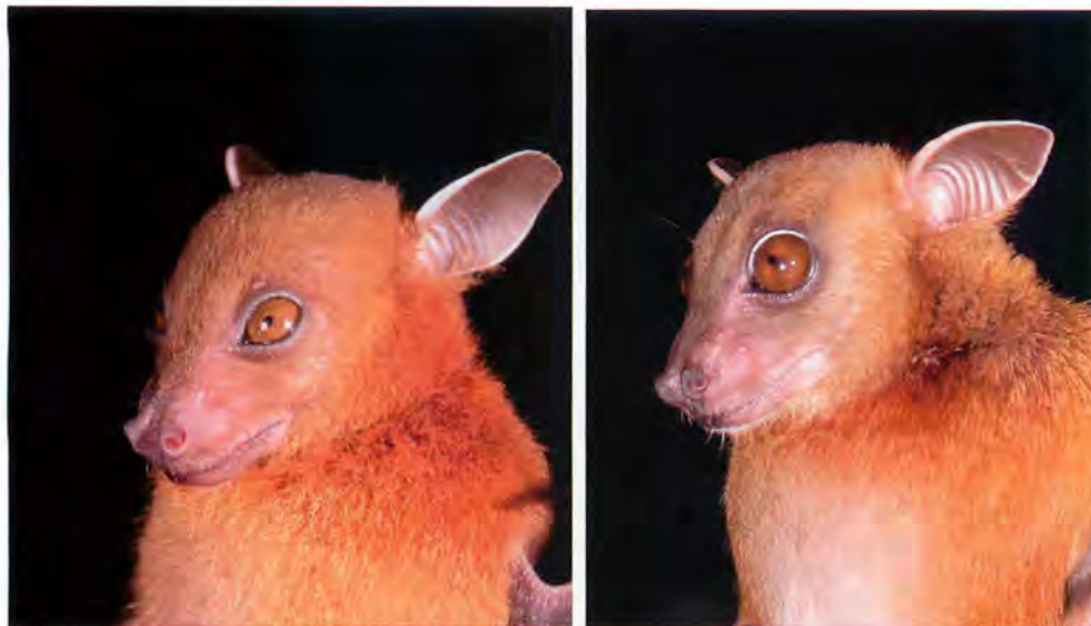
Figure 1. Male Cynopterus brachyotis (left) and C. sphinx (right).

Discriminant function analysis is widely applied for separating individuals of similar size, both between species and between sexes on the basis of morphological characters (ARLETTAZ ET AL. , 1990, 1997; KITCHENER & MAHARADATUNKAMSI, 1991; BRUSEO ET AL. , 1999; REUTTER ET AL. , 1999; BRONNER, 2000; PURKAIT & CHANDRA, 2004). This statistical technique is also capable of detecting the most reliable discriminating characters based on the known species.