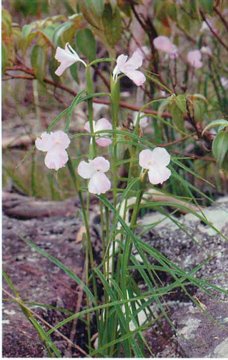
Figure 2. C. laotica , habit showing linear leaf blades and pale violet staminodes and lip.