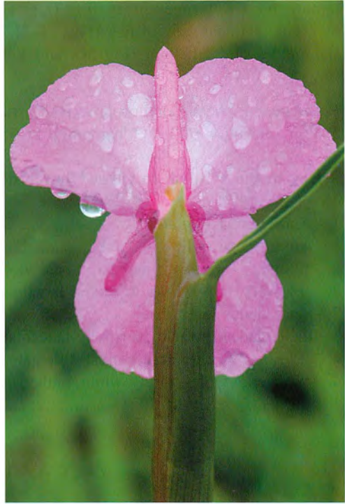
Figure 6. C. burtii K. Larsen & Jenjitt, ventral view showing violet corolla lobes.