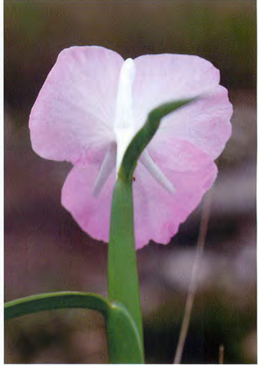
Figure 3. Rear view of a flower showing white corolla lobes, staminodes and lip.