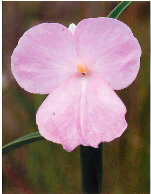
Figure 4. Front view of a flower showing staminodes and labellum.