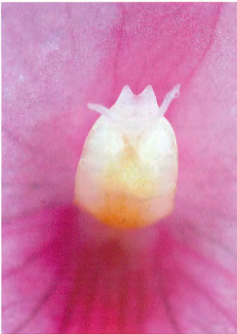
Figure 7. C. burtii K. Larsen & Jenjitt, stigma, anther locules and anther crest.