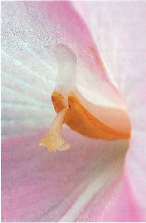
Figure 5. Stigma, style, anther locules, and anther crest.