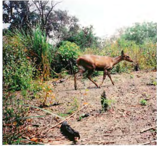
Figure 3. Adult female Hog Deer Axis porcinus . Camera trap photo taken between 9 February and 16 March, 2006