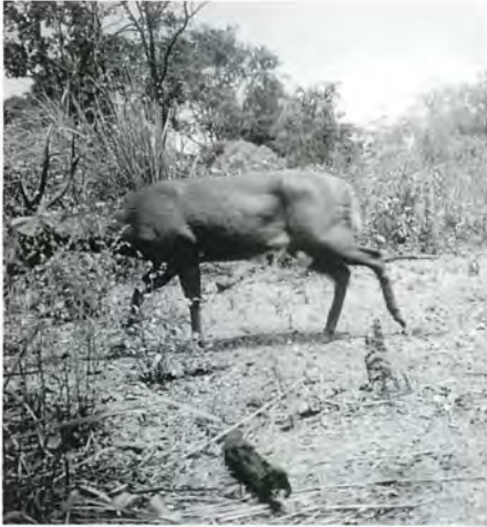
Figure 2. Adult male Hog Deer Axis porcinus . Camera trap photo taken between 9 February and 16 March, 2006