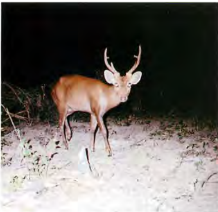
Figure 4. Adult male Hog Deer. Camera trap photo taken between 9 February and 16 March, 2006.