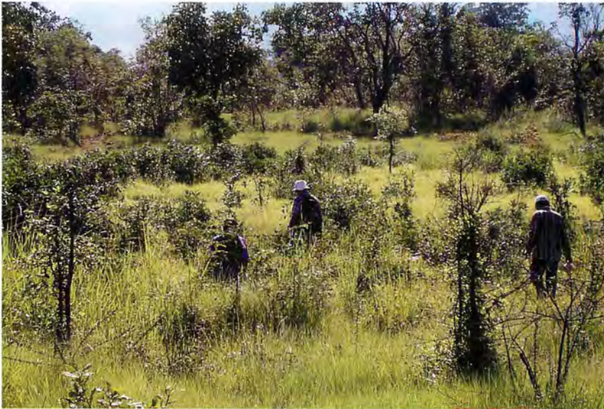
Figure 7. Habitat at the Hog Deer reconnaissance site, 25 May 2006, early rainy season; grassland mosaic with riparian forest in background. By the end of the rainy season, the grasses at this site will probably grow to at least 1.5 m height.