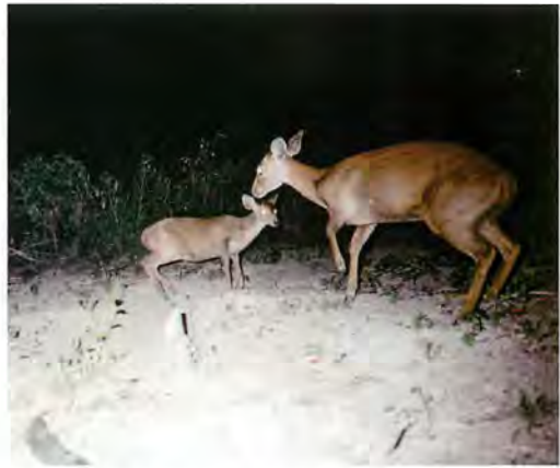
Figure 5. Adult female Hog Deer and fawn. Camera trap photo taken between 23 January and 9 February, 2006.