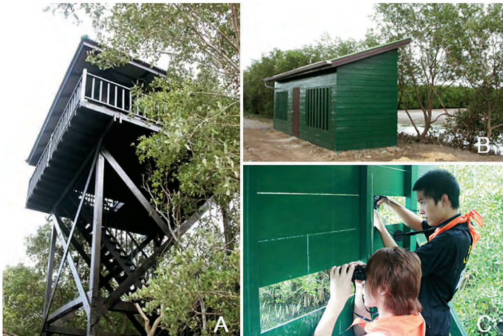
Figure 4. Some facilities in Bang Pu Nature Reserve: A, canopy observation tower; B, bird observation hide; and, C, visitors watching birds from a bird blind.