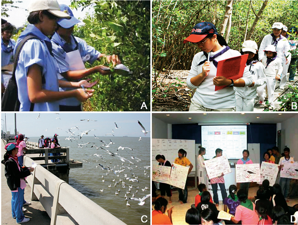
Figure 6. Educational activities of BNEC conducted in the reserve and surrounding area: A, students observing structure of mangrove leaves during ecological course; B, students studying root systems of trees within the nature reserve from a board walk; C, students learning to identify species of gulls at Sukta Pier; and D, groups of students presenting their observation results in the nature reserve and sharing knowledge with other groups at BNEC.

Despite the massive land-use changes within recent decades, the Inner Gulf area remains of international importance as a staging post and wintering area for shorebirds. Some 150–300,000 migratory waterbirds use the site annually (BCST, 2004); of these, Bang Pu regularly supports concentrations of 10,000–20,000 shorebirds, terns and gulls. The Inner Gulf, comprising the Bang Pu site, has been identified as an Important Bird Area (BCST, 2004).