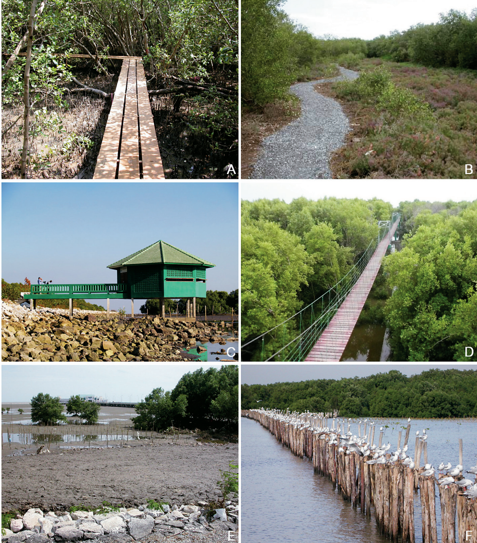
Figure 5. Some infrastructures in Bang Pu Nature Reserve and surrounding mangrove environment: A, boardwalk; B, nature trail; C, bird observation tower; D, canopy observation bridge; E, exposed mudflats at low tide in front of the reserve, with Sukta pier behind; and F, Brown-headed Gulls resting on wood pilings on mudflats in front of the reserve.