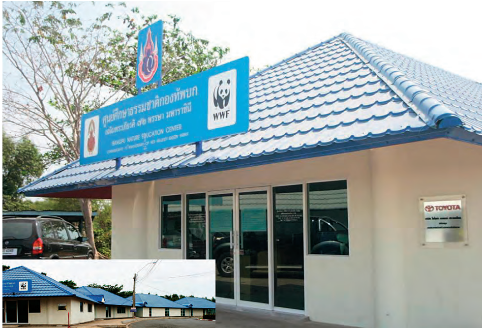
Figure 3. Bang Pu Nature Education Centre.