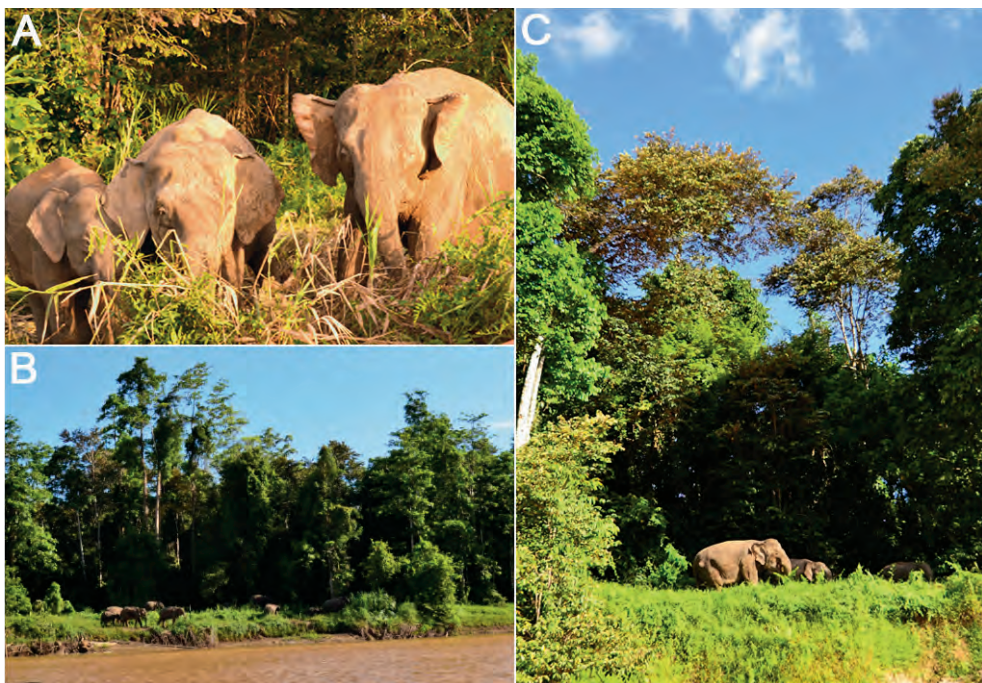
Figure 1. The Bornean elephant ( Elephas maximus borneensis ) in the Lower Kinabatangan Wildlife Sanctuary, Sabah, Borneo. A: Elephants at the riverbank near Sukau, on the way to the old palm oil plantation field site, lot 2, January 2013. B: About 20 elephants gather at the riverbank before crossing the Kinabatangan River, lot 6, May 2013. C: Elephants near the Danau Girang Field Centre, where researchers track their movement using GPS-collars, lot 6, May 2013. All photographs taken by Antoinette van de Water.

In the Lower Kinabatangan Wildlife Sanctuary (Fig. 2), Bring the Elephant Home Foundation cooperates with HUTAN (Kinabatangan Orang-utan Conservation Programme), KOPEL Community Cooperative (MESCOT), Danau Girang Field Centre (DGFC) and the Sabah Wildlife Department to restore elephant habitat. Recently, the Forest Restoration Research Unit (FORRU) of Chiang Mai University joined the collaboration, by providing a