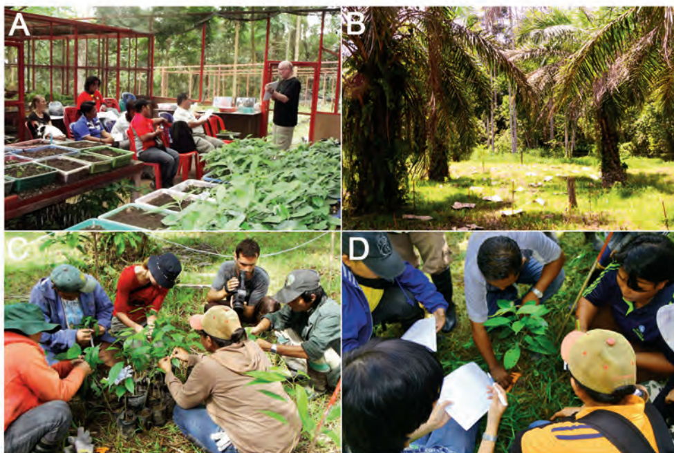
Figure 3. Activities to restore habitat of the Bornean elephant. A: Forest restoration workshop at the research nursery of FORRU (Chiang Mai University) with a focus on nursery maintenance, research and reforestation techniques to improve the current reforestation programs of HUTAN and MESCOT. B: The beginning of the transformation of a palm oil plantation back into a forest ecosystem. The planted seedlings have been covered by cardboard mulch mats in order to suppress the weed growth and reduce the labor cost of weeding. Also, they help to preserve the moisture into the soil and will turn into compost when rotten down. C: Numbering and labeling the seedlings before planting them out in the experimental plots by members of HUTAN, the Lower Kinabatangan Wildlife Sanctuary, Sabah. D: Members of HUTAN are using a vernier caliper to measure the root collar diameter of the planted trees of the experimental plots during a tree monitoring workshop near Sukau, Sabah.

adopted, testing 15 indigenous forest tree species (20 individuals per species per plot) for field performance, both in an oil palm plantation and along an old logging road. The plots are monitored (tree height, crown width, root collar diameter, health and weed scores) for both relative species performance and the effects of various fertilizer treatments, two weeks after planting and subsequently, at the end of the first and second flood seasons. The first report will be published in March 2015 and will provide a guide as to the most suitable tree species for swampy areas, in oil palm plantations and other degraded areas. This collaborative project lays the foundation for a sustainable program that grows, plants and cares for a minimum of 25,000 trees annually, hopefully playing a major role in the conservation of both the Bornean elephant as well as the multitude of other species with which it shares its habitat.